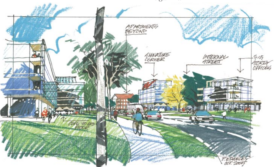
Werribee Technology Precinct - a place where new enterprises have room to grow in a successful mixed-use environment