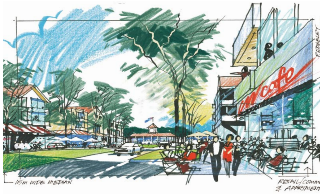
Toolern - a new community with a range of housing choices close to jobs and services