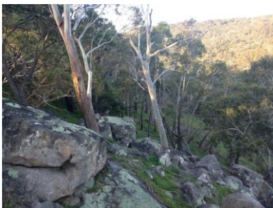
Northern steep terrain and rocky outcrop