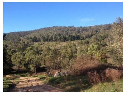
View from southern knoll