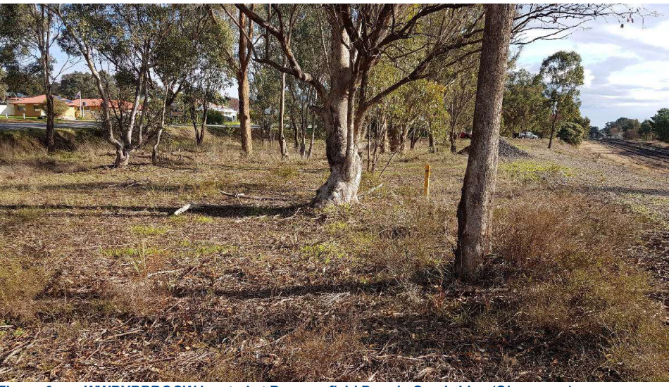
Figure 6 WWBYBBRGGW located at Beaconsfield Parade Overbridge (Glenrowan)

not observed in investigation areas south of Glenrowan, whereas yellow box ( E. melliodora ) was recorded in several locations from Broadford to Wangaratta.