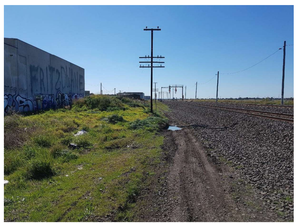
Figure 8 Western section of the rail corridor within the McIntyre Road (Sunshine) Investigation Area

The eastern section of the rail corridor was also degraded with several noxious weeds present. The northern end of the survey area had areas of Plains grassland dominant by kangaroo grass ( Themeda triandra ) present, which was considered suitable habitat for spiny rice-flower. The southern end was disturbed with piles of spoil dominated by exotic vegetation. This section of the investigation area is adjacent to the privately-owned Solomon Heights Grassland. There appears to be no management regime to the northern end of the survey area, although areas adjacent to the rail corridor to the south had been burned within the last 6 months.