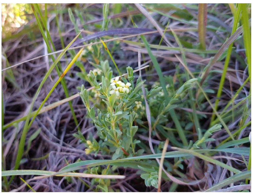
Figure 9 Flowering spiny rice-flower recorded north of the McIntyre Road (Sunshine) Investigation Area