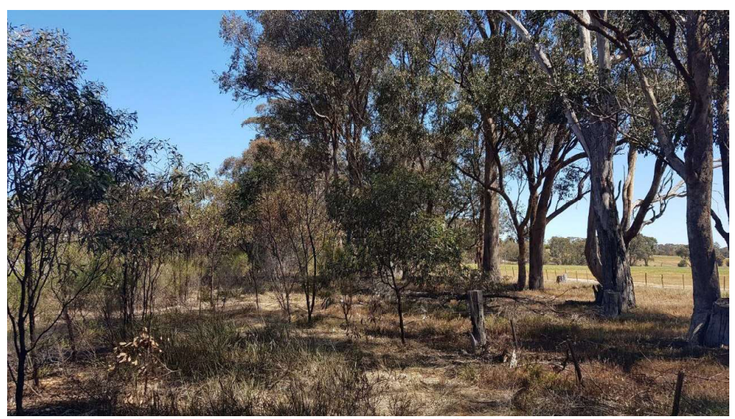
Figure 7 VTWBC located at Hume Freeway Seymour Precinct (Seymour)

The mapped community at these locations generally contained a consistent tree cover, typically with large trees, including several with hollows (notably at Track Slew E and Seymour-Avenel Road Overbridge (Seymour)). Hollow-bearing trees are considered an important habitat feature for several woodland birds and also other fauna species. The location of hollow-bearing trees is included in Appendix H.