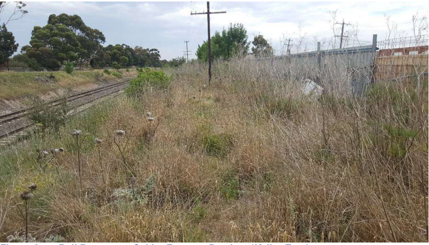
Figure 2 Rail Reserve at Calder Freeway Precinct (Keilor East)

North of Beveridge, the regional Victorian investigation areas, which contain railway stations— Seymour, Euroa, Benalla, Glenrowan and Wangaratta—have also been subject to significant disturbance, from intensive rail activities, storing of ballast and other materials and car parking.