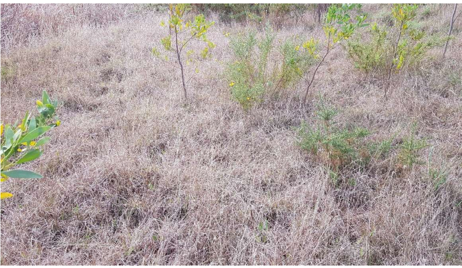
Figure 5 Kangaroo Grass dominated patch at Track Slew Investigation Area C