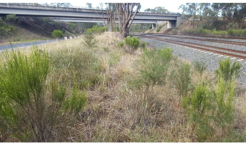
Figure 3 Rail Reserve at Hume Highway Seymour Precinct (Seymour)

Overall the vegetation within the investigation areas generally represented disturbed and modified environments. Often colonising species were dominant, including blanket weed ( Galenia pubescenes ), artichoke thistle ( Cynara cardunculus ), cat's ear ( Hypochaeris radicata ) and ribwort ( Plantago lanceolata ), and exotic pasture grasses, such as phalaris ( Phalaris aquatica ), paspalum ( Paspalum dilatatum ), brown-top bent-grass ( Agrostis capillaris ) and rye-grass ( Lolium rigidum ). This was also reflected in the dominant native species, which often comprised windmill grass ( Chloris truncata ), silky blue-grass ( Dicantheum sericeum ), jersey cudweed ( Laphangium luteoalbum ) and sifton bush ( Cassinia sifton ). These species often appeared to be colonising disturbed areas.