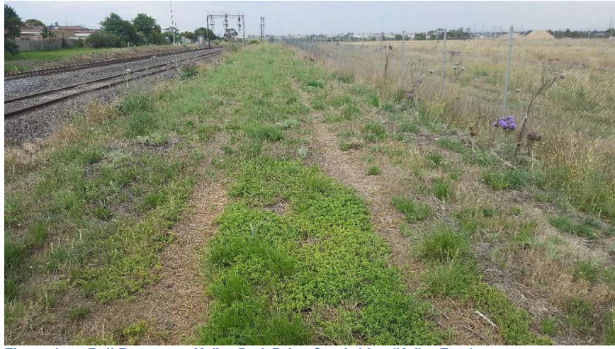
Figure 1 Rail Reserve at Keilor Park Drive Overbridge (Keilor East)