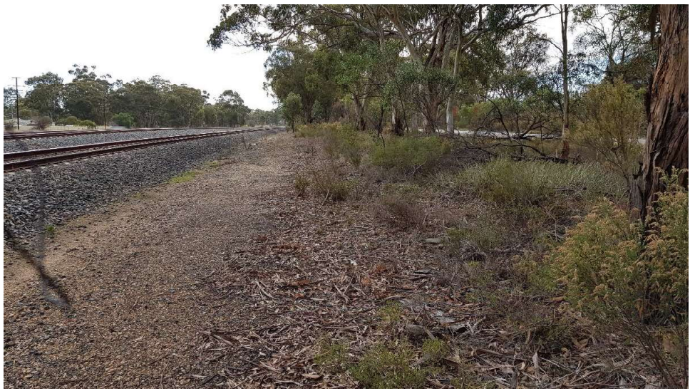
Figure 4 GBGW at Track Slew Investigation Area I between Seymour and Mangalore

The biodiversity assessment identified five investigation areas north of Beveridge in the Seymour area where there was likely presence of GBGW (Table 8). All locations have remnant vegetation present within the rail reserve that extends into adjacent road reserve. These areas are relatively undisturbed and contain a diverse understorey with a mature overstorey, though most of the mature trees are in adjacent road reserves (Figure 4).