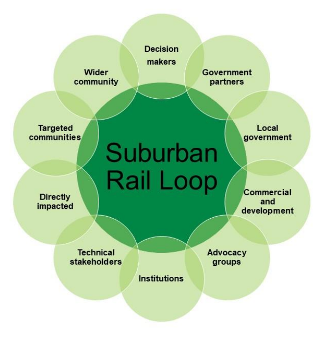
Figure 4: Key stakeholder groups

Key stakeholder groups for SRL are shown in Figure 4.