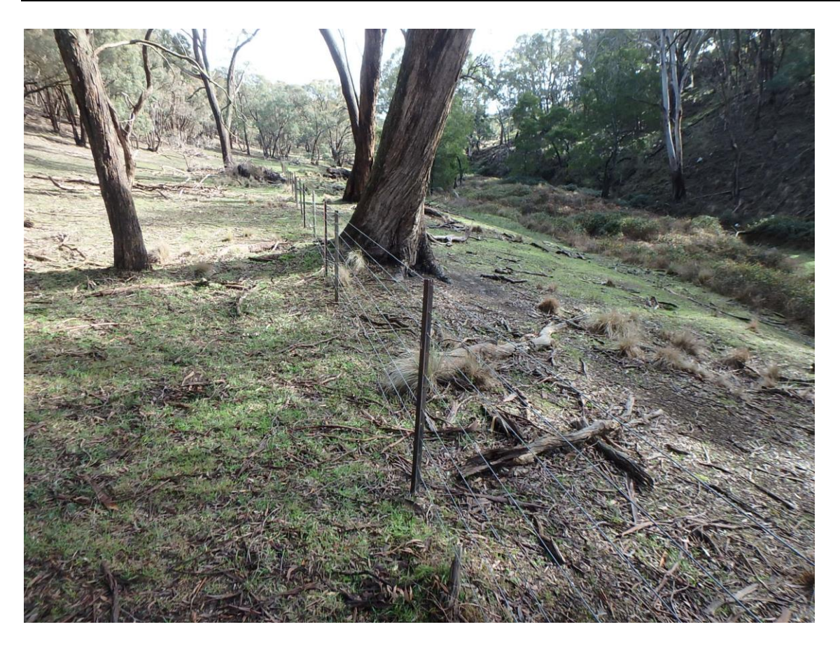
Plate 1. Part of the subject land fronting the Moorabool River.