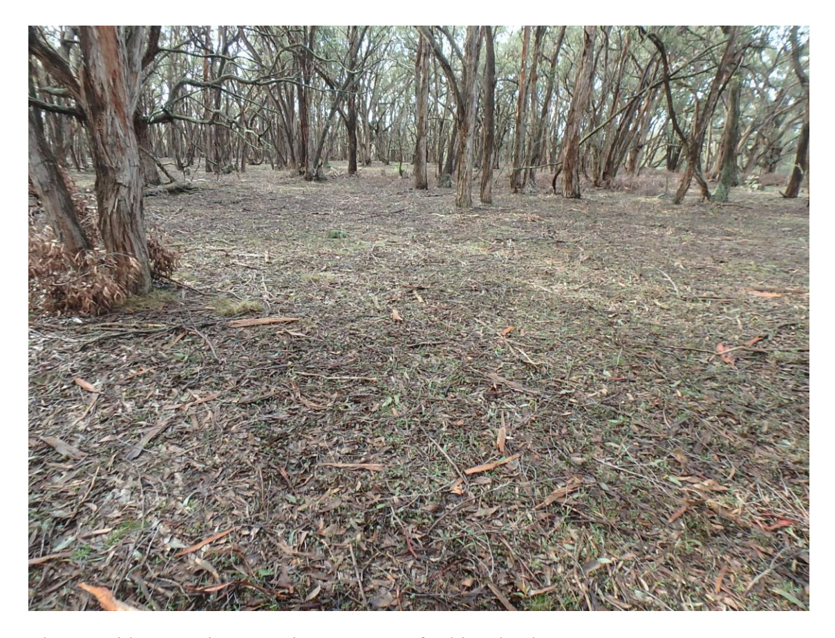
Plate 2. Ridge crest in approximate centre of subject land.