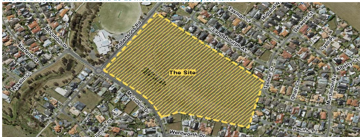
Site: 18-24 Robertsons Road and 16-28 McCubbin Drive, Taylors Lakes

The Fast Track Government Land Service has been established to provide a consistent and transparent process to facilitate changes to planning provisions for government land. Land owning departments and agencies can request to have changes to the planning provisions of their sites through this new service, administered by Department of Environment, Land, Water and Planning.