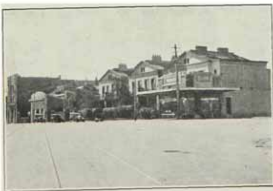
Mixed development on Wellington-parade, East Melbourne.

Although every effort has been made to subdivide the metropolitan area into zones according to the predominating and natural development which exists, or might reasonably be expected to