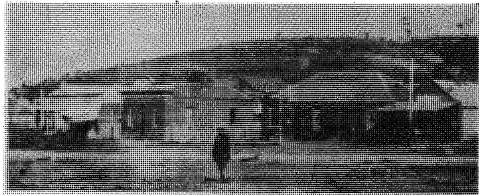
PH7 High Street West Side c1860