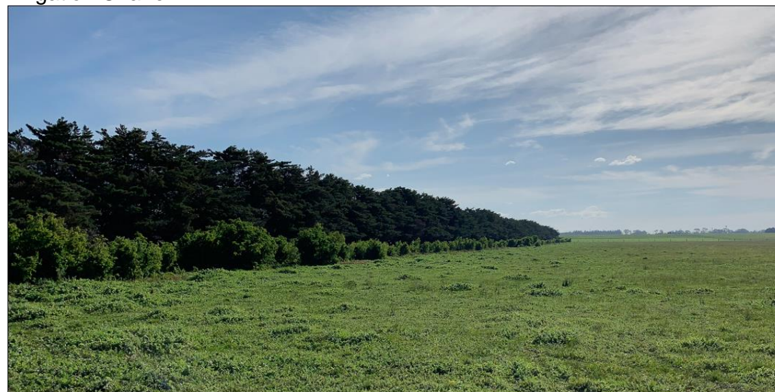
Existing windrow in the north west corner