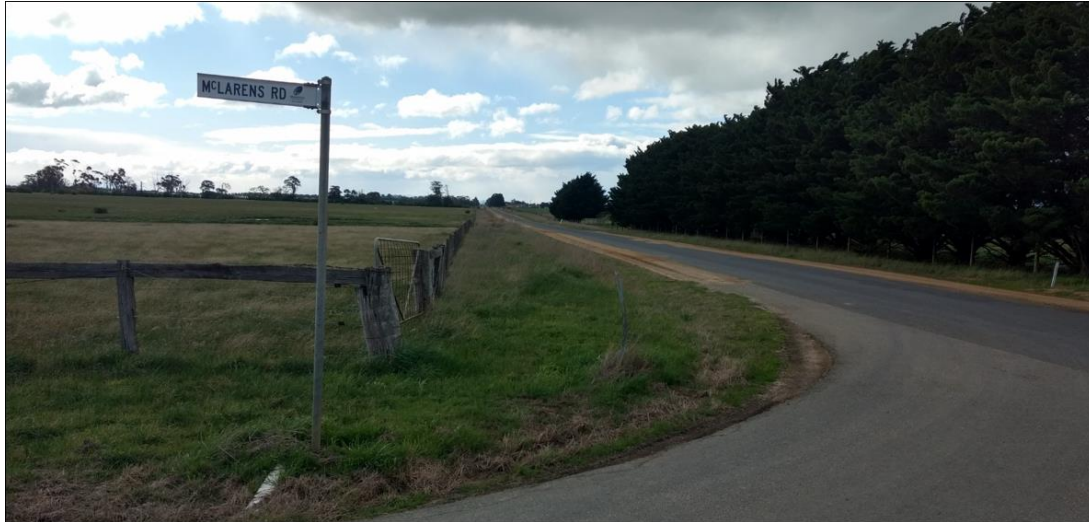
Hopkins and McLarens Road Intersection