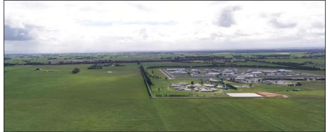
View from north-east of the site. Fulham Correction Centre located to the right of the image