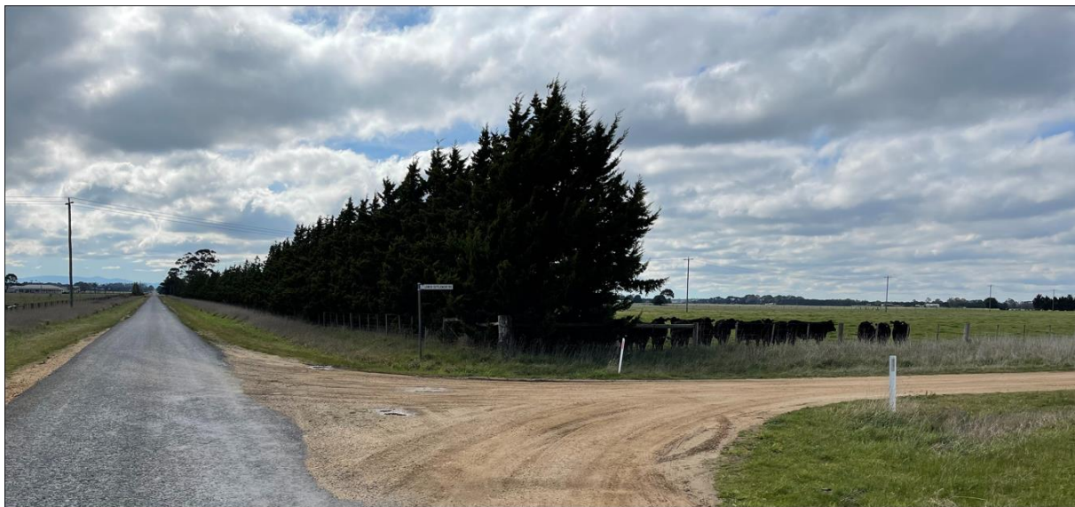
66KV Powerline intersecting Settlement Road (corner of Lower Settlement Road)