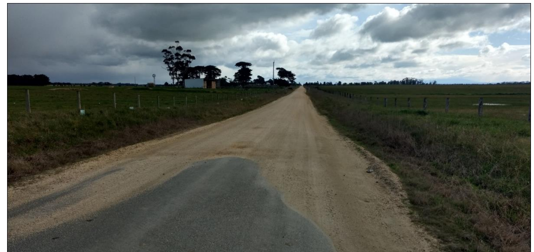
McLarens Road (Subject site to the right)