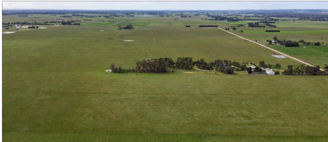
Drone Footage taken from west of the site looking to the east. Road running along the right side of the image is McLarens Road, cluster of trees in the centre is 379 McLaren's Road.