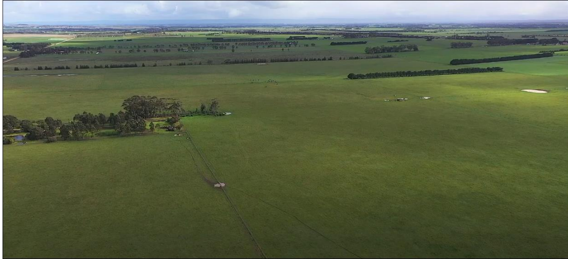
Drone Footage taken from centre of the site looking to the west. First windrow to the right of the image defines the property boundary.