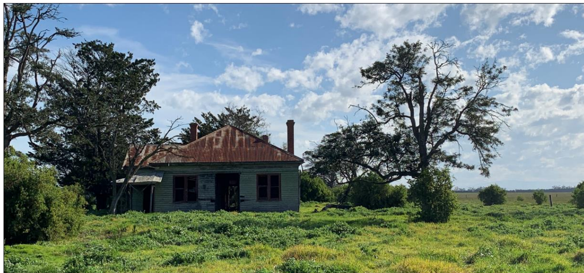
Vacant dwelling on site