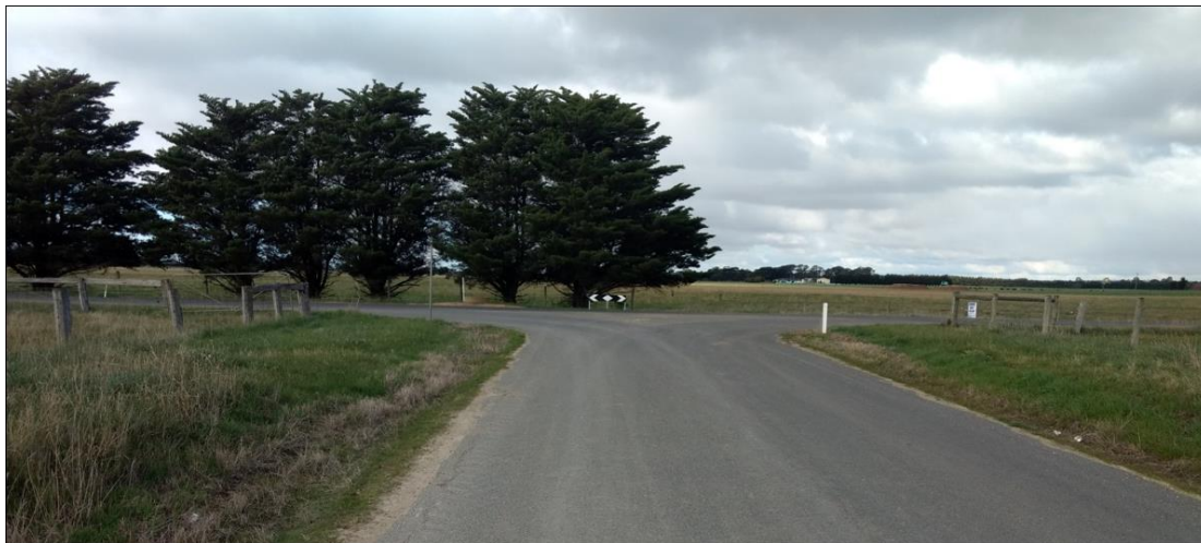
Hopkins and McLarens Road Intersection (Subject site to the left)