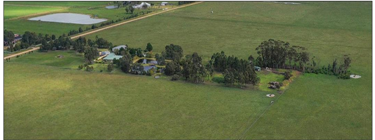
South of the site: 379 McLaren's Road Fulham