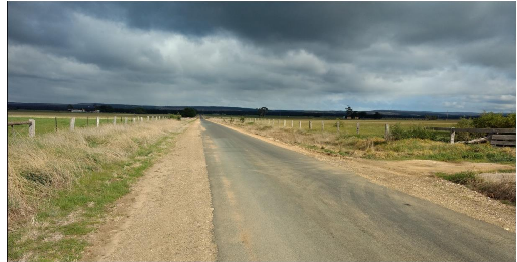
Hopkins Road (Subject site to the right)