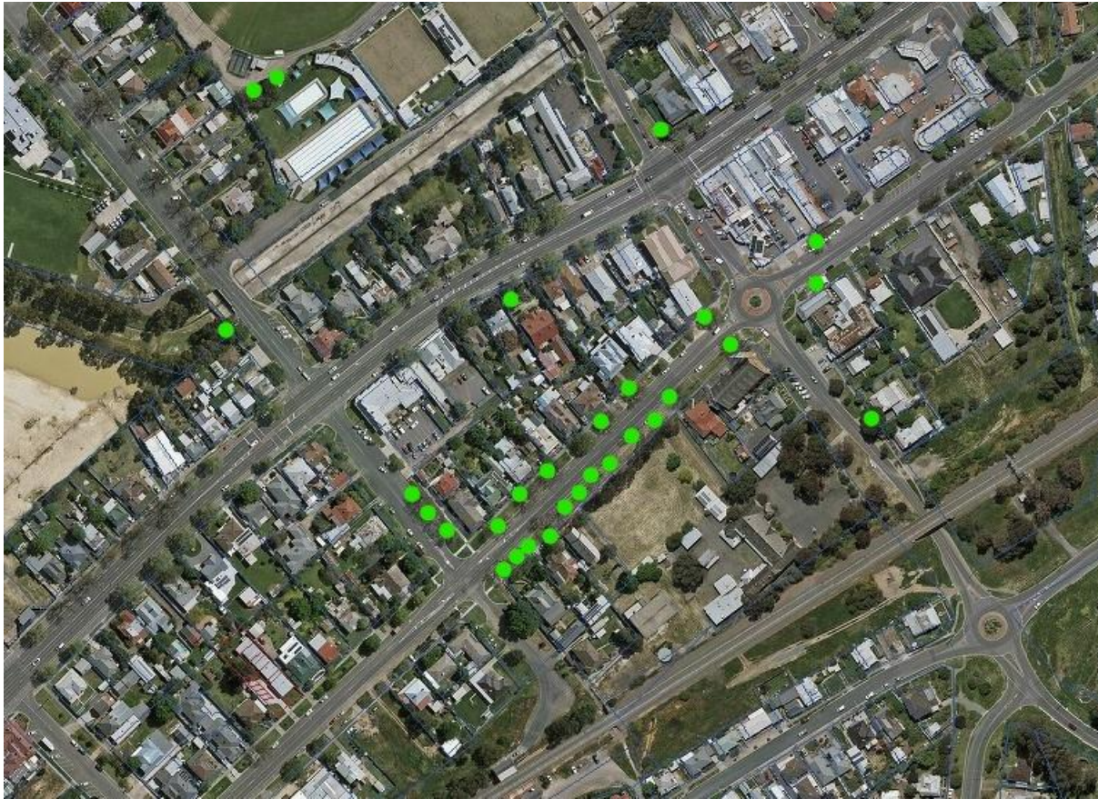
Figure 2 – Laurel Street Precinct significant trees as shown by green dots