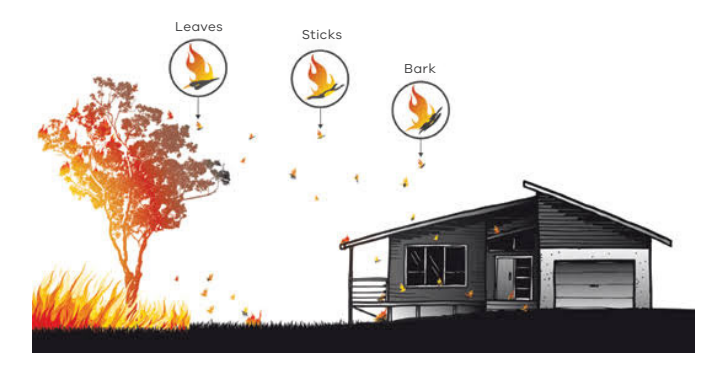
Figure 2 – Ember attack on a structure.

Ember attack is the most common way houses catch fire during a bushfire. Ember attack occurs when small burning twigs, leaves and bark are carried by the wind, landing in and around houses and their gardens. If they land on or near flammable materials, such as leaf litter and dead plant matter, they can develop into spot fires. Embers can also ignite a house if they land on or near vulnerable parts of the building (such as decks).