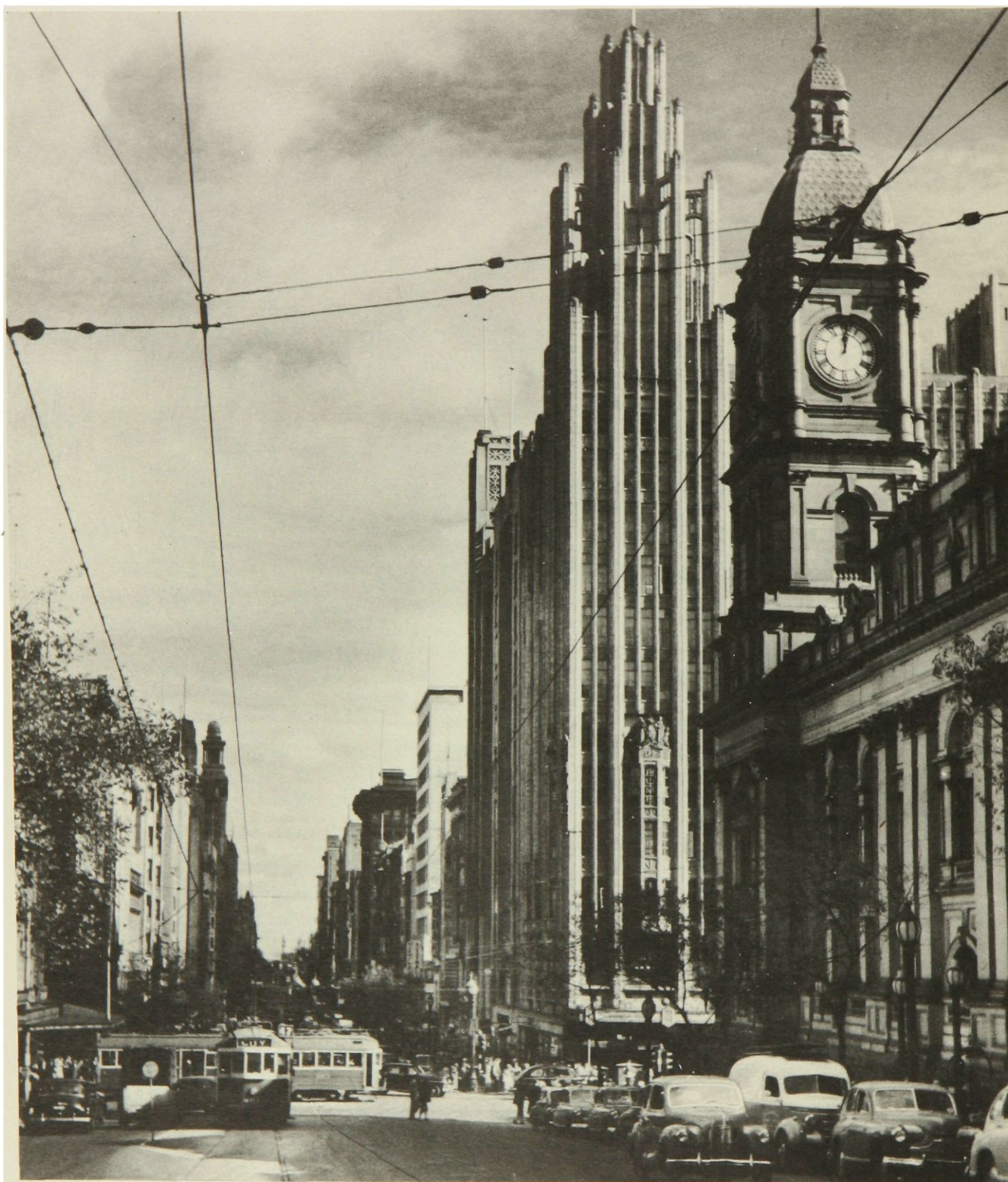
The Heart of Melbourne