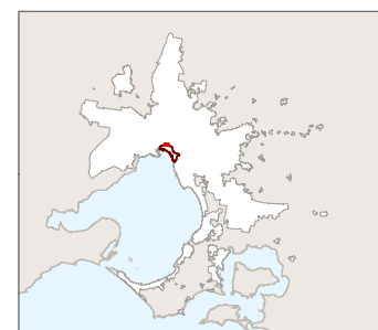
Part of Planning Scheme Map 3SCO

Disclaimer This publication may be of assistance to you but the State of Victoria and its employees do not guarantee that the publication is without flaw of any kind or is wholly appropriate for your particular purposes and therefore disclaims all liability for any error, loss or other consequence which may arise from you relying on any information in this publication.