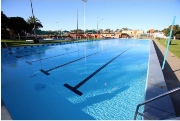
Figure 41. Golden Square Swimming Pool.

The Golden Square Swimming Pool was constructed in 1911 on land that is marked as ‘Tailings’ on Black’s re-survey plans. It quickly became a local gathering place. It is said to be the first public swimming pool to allow mixed bathing (community engagement responses). Initially constructed as a simple dam with a mud bottom, it was reconstructed in the 1960s to the current configuration and is now managed by a local community group.