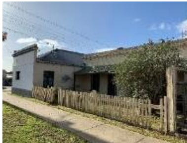
Figure 50. House and Warehouse corner of Laurel and Panton streets