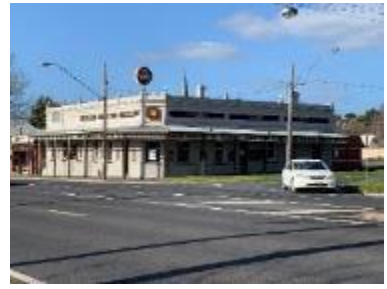
Figure 51. Golden Square Hotel, on the corner of High and Maple streets