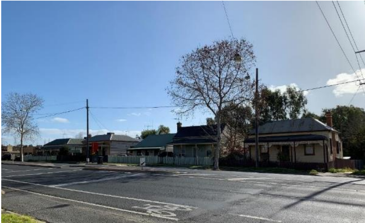
Figure 56. Housing on the north side of High Street, west of Maple Street shows a mix of Victorian housing styles.

The commercial buildings of Golden Square were strung out along High Street, often in small groups broken up by housing. The former Howe's fruit shop at 330 High Street is one example of this type of development. The shopfront was relatively intact until late 2020 when a vehicle damaged large sections, but the form of the weatherboard shop remains legible. The commercial centre of Golden Square saw more concentrated development around the intersection of High and Laurel streets, where strips of shops remain today. While many of these are mid- or late twentieth century developments, there are some earlier buildings remaining at 295-297 High Street. The shop fronts date to the Interwar period, although detailing of the side walls of no. 295 hints at their earlier origins, with all three shops visible on 1934 aerial photography (Bendigo Mines Ltd) in their current form. Rear elements of the other shops in this strip also retain signs of their Victorian or early 20 th century origins. A chimney at 303 High Street, a formerly detached shed or warehouse at 305 and a glimpse of polychromatic brickwork at 301 High Street are the only visible remains of the earlier structures, the parapets, shop fronts and verandahs all being either reconstruction or altered beyond recognition. They do provide evidence of the continued commercial function of the strip, however.