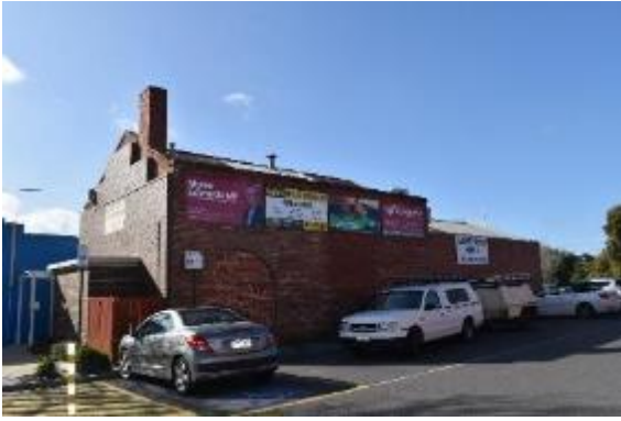
Figure 43. Golden Square Working Men’s Club.