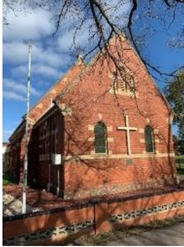
Figure 47. St Mark's Anglican Church, Panton Street