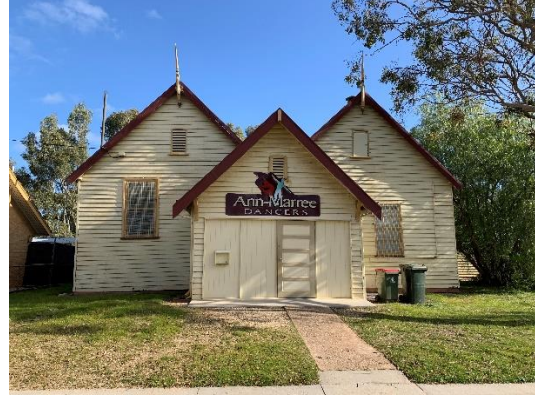
Figure 42. Former Scout Hall, 15 Maple Street.