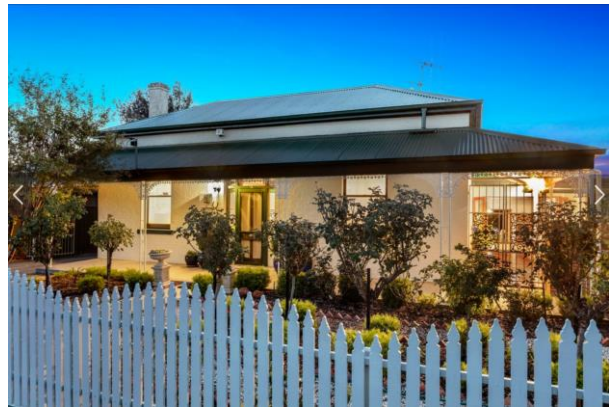
Figure 40. 342 Panton Street, Golden Square.