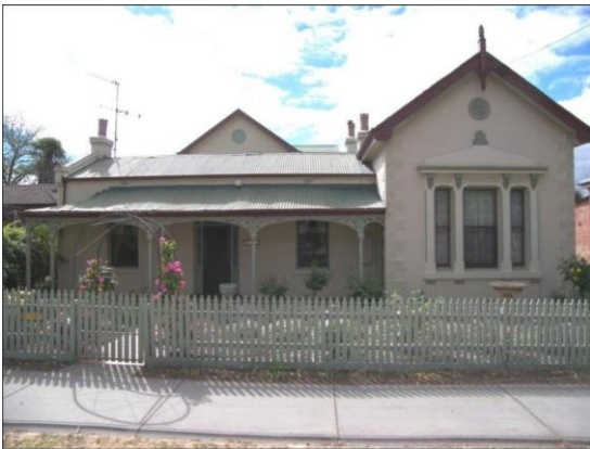
Figure 39. 34 Panton Street, Golden Square c. 2009. The house itself is largely unchanged.

When Osborne sold the property in 1876, it was described in the advertisement as ‘That most desirable freehold allotment ... with the exceedingly handsome family residence in brick erected thereon, containing 7 rooms and kitchen, first-class stables (two storey), and excellent garden’. ( Bendigo Advertiser 6 March 1876:4) The property was purchased by corn dealer Thomas Jones, who sold it to speculator Alfred Beeson in 1883.