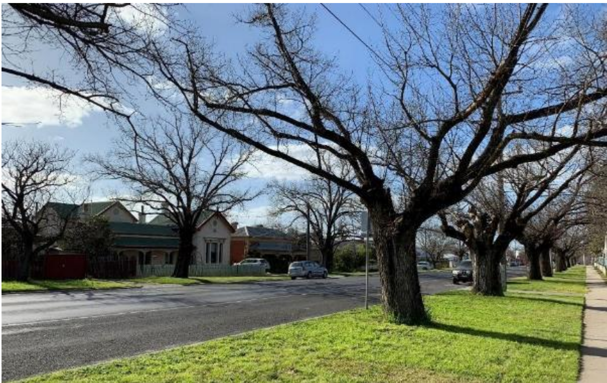
Figure 55. Panton Street, looking north towards the intersection of Panton and Laurel streets.

The precinct offers a showcase of the variety of housing in Golden Square, from the earliest gold mining settlers through to the Interwar period. It is reflective of the patterns of development seen throughout Greater Bendigo, where it is unusual to find areas of homogenous development. While there are pockets, such as the Victorian housing at 332 – 340 High Street, which is a collection of small-scale cottages and villas that remain largely intact, it is more common to find areas where the original subdivisions have been further broken up over time to create a mixed streetscape like that at 38-42 Panton Street or 306-328 High Street, which although largely Victorian also includes a mix of Edwardian, Interwar and Postwar housing. In spite of varied rhythm and scale, a sense of unity is created in the streetscape, and across all residential areas of the precinct, by the planting of exotic street trees and small front setbacks contrasted with wide streets. Many of the gardens also include notable trees, such as the palms in the house built for Robert Batchelder at 325 High Street, or the fig tree on the front boundary of 7 Laurel Street. These are indicated, along with other notable examples, in Figure 19.