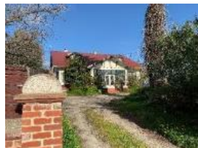
Figure 54. Interwar bungalow at 325 High Street

The existing Laurel Street Precinct (HO25) consists of churches, schools, hotels and housing on High, Laurel and Panton streets, as well as the site of the first gold find in the Bendigo area and recreational facilities on Maple Street. The precinct is located in the heart of the former Golden Square commercial, social and civic centre. It encompasses the life of the early gold settlement with a variety of housing types to compliment the public buildings. The precinct demonstrates