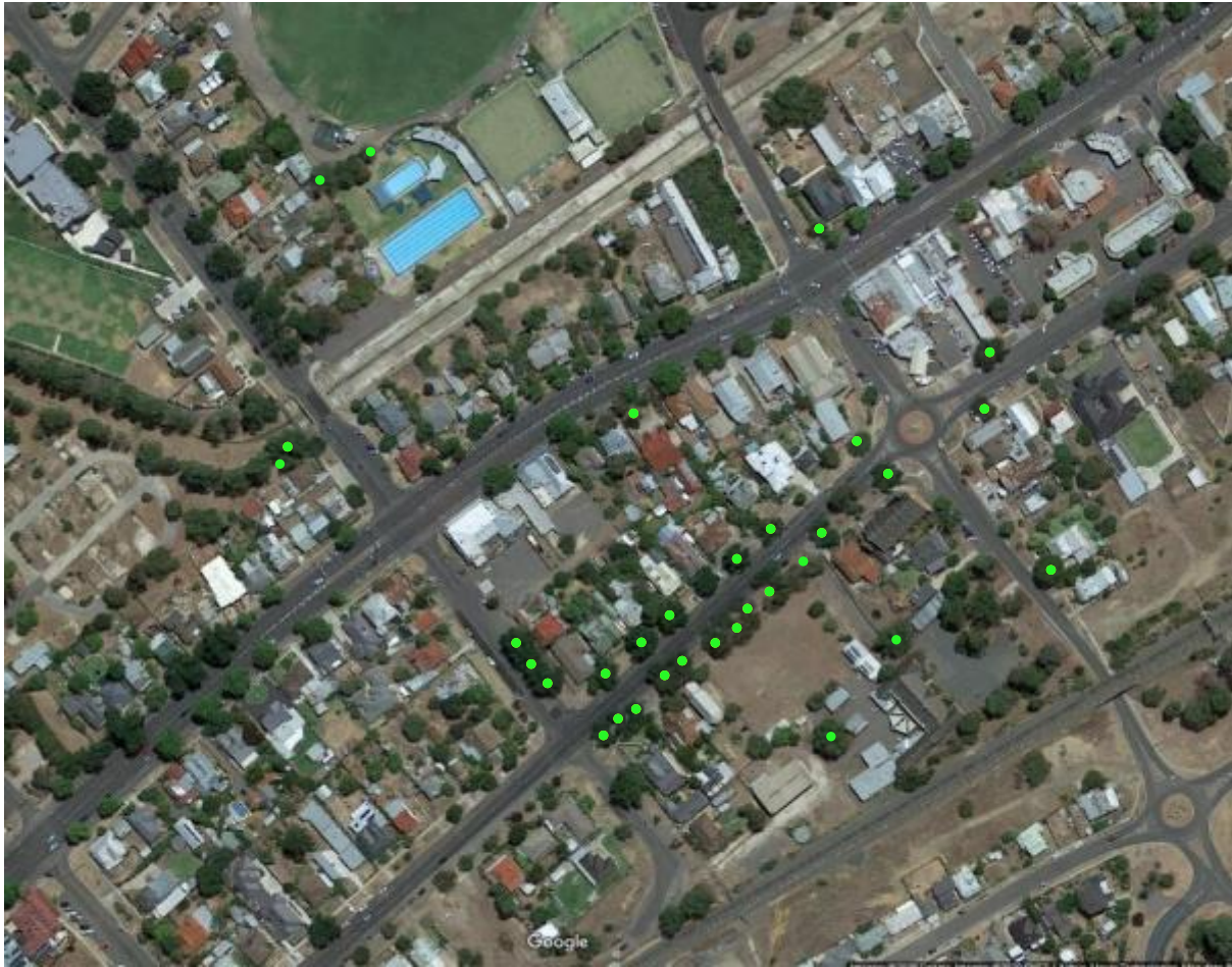
Figure 58. Significant trees within the Laurel Street Precinct, indicated with dots.