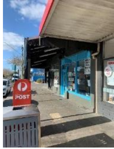
Figure 48. Shops on High Street