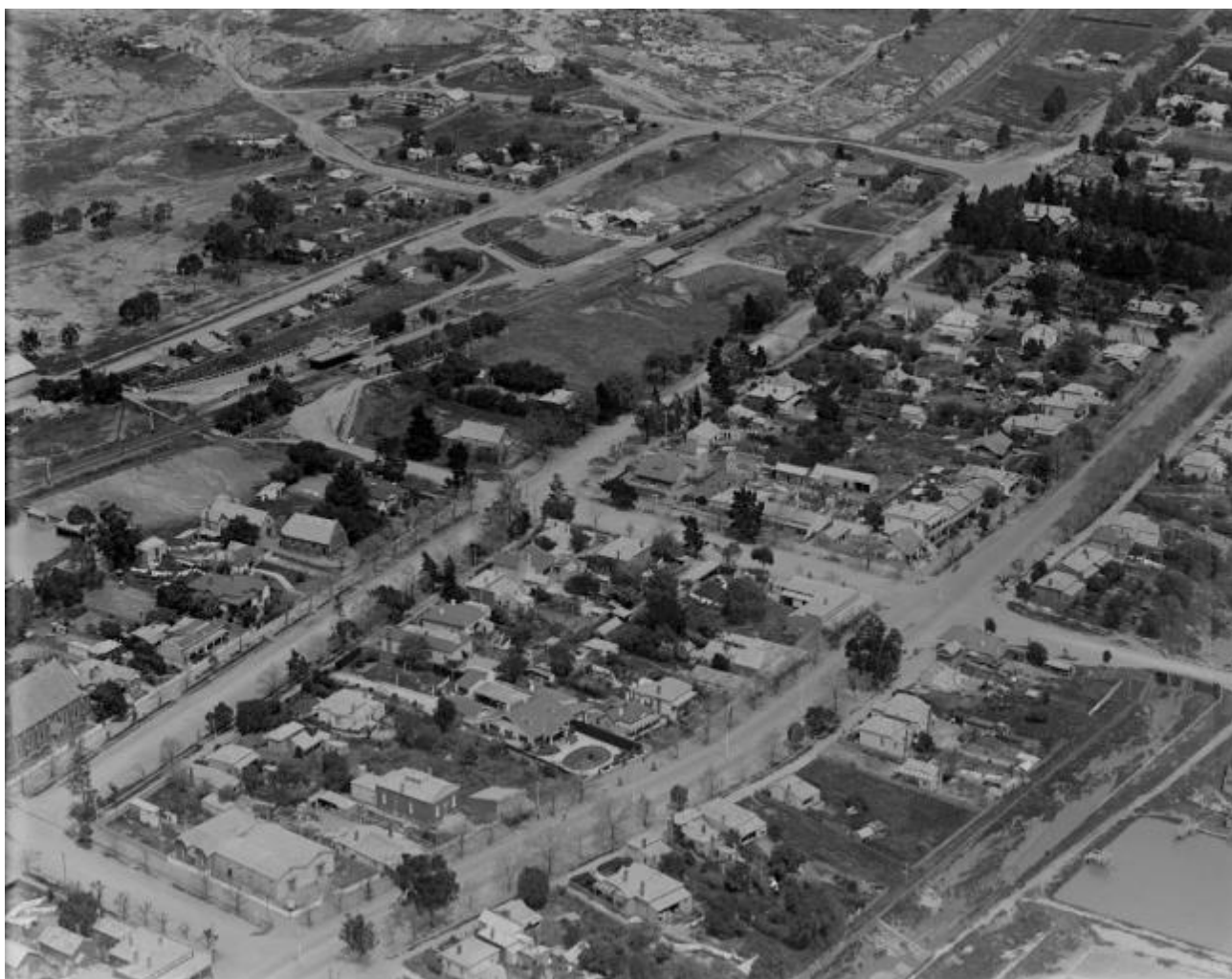
Figure 45. Aerial view of High Street and Pantom Street ca 1925-1940, Laurel Street is at the bottom left.