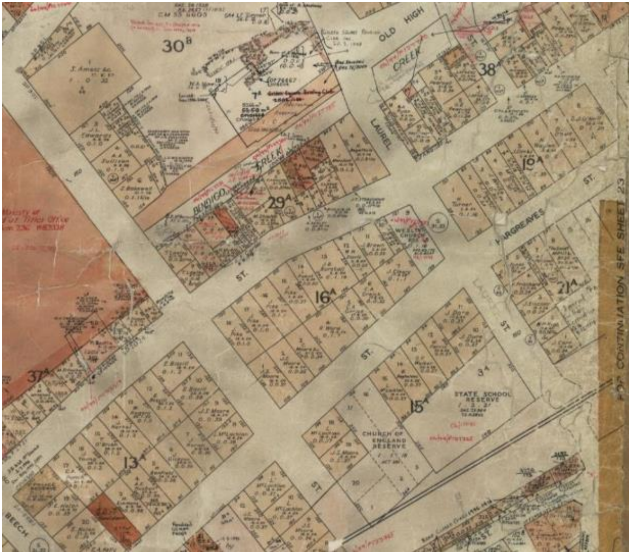
Figure 37. Detail of Sandhurst Parish Plan 22 showing the Laurel Street Precinct area.