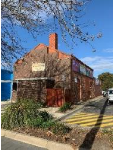
Figure 46. Working Men's Club, High Street