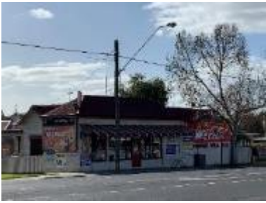
Figure 49. Store and residence on corner Maple and High streets