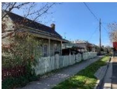
Figure 53. Victorian cottage at 334 High Street