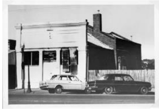
Figure 44. Golden Square Working Men’s Club in the 1970s before the original Post Office to the front of the building was demolished.

The first recorded use of 291 High Street was as a Post Office in 1859. The Post Office relocated in 1877, although the location of the next Post Office has not been identified. The use of the building over the next six years is unclear, but in 1883 it was one of the sites suggested to house a club in Golden Square. Reverend H. J. Howell of St Marks Anglican Church had instigated the idea as a possible response to concerns about the large numbers of youths who could be found on the streets at night engaging in larrikin behaviours. The idea proved popular and those recommending the club joined forces with another group agitating for a Mechanics Institute for Golden Square, who had already been promised assistance from Council. Funds were raised to lease the former post office for an initial six months, with an option to purchase the building during the term of the lease.