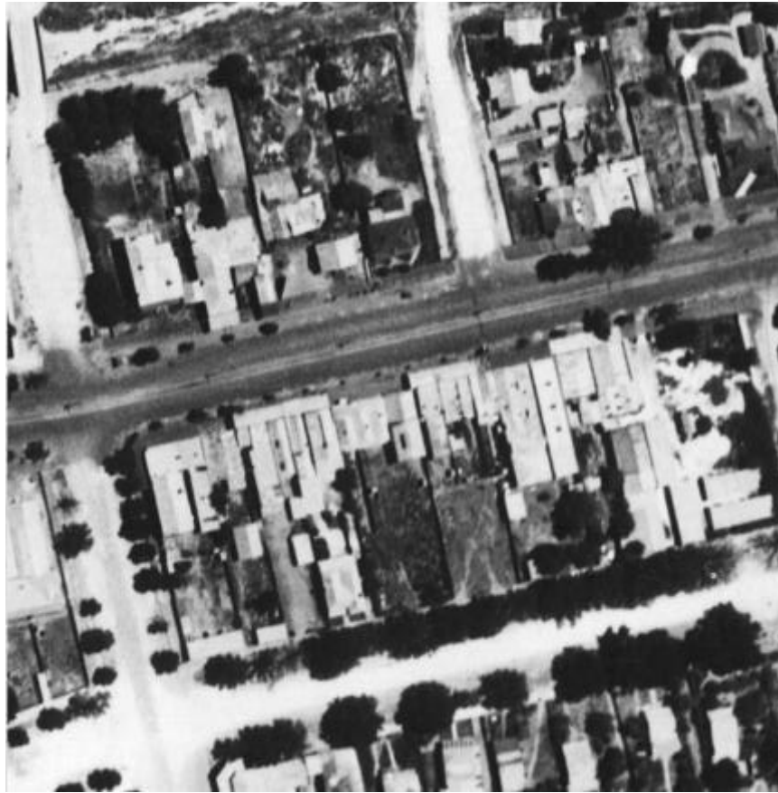
Figure 57. The High Street commercial area, taken from 1934 aerial photograph.

At the southern end of the commercial strip, the former Golden Square Post Office (321 High Street) is a modest late Interwar weatherboard building now serving as a massage business. Although now lacking its Australia Post signage, the building itself is substantially intact to its Interwar form. No traces of the earlier post office on the site remain.