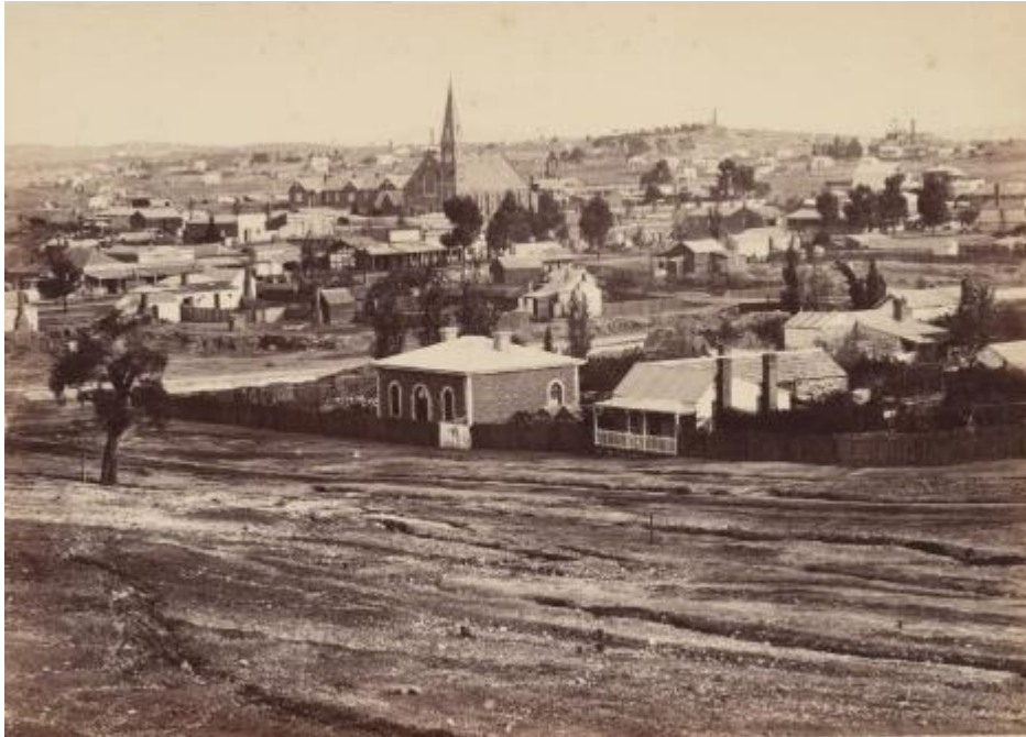
Figure 36. N. J. Caire's photograph of the township of Golden Square c. 1873 is dominated by the Methodist Church with the school beyond.

From Eaglehawk and Bendigo Heritage Study 1993 Golden Square Precinct :