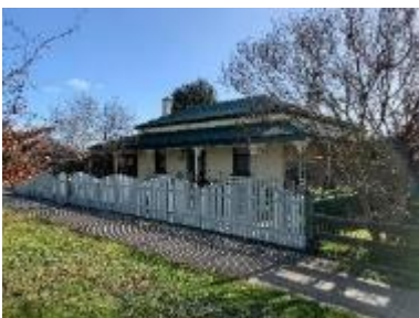
Figure 52. Early Victorian villa at 42 Panton Street