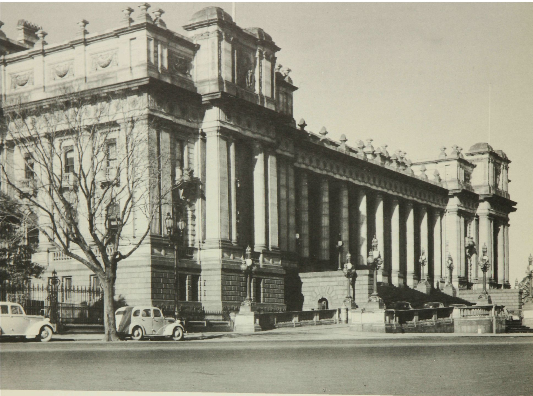
State Parliament House — the seat of government