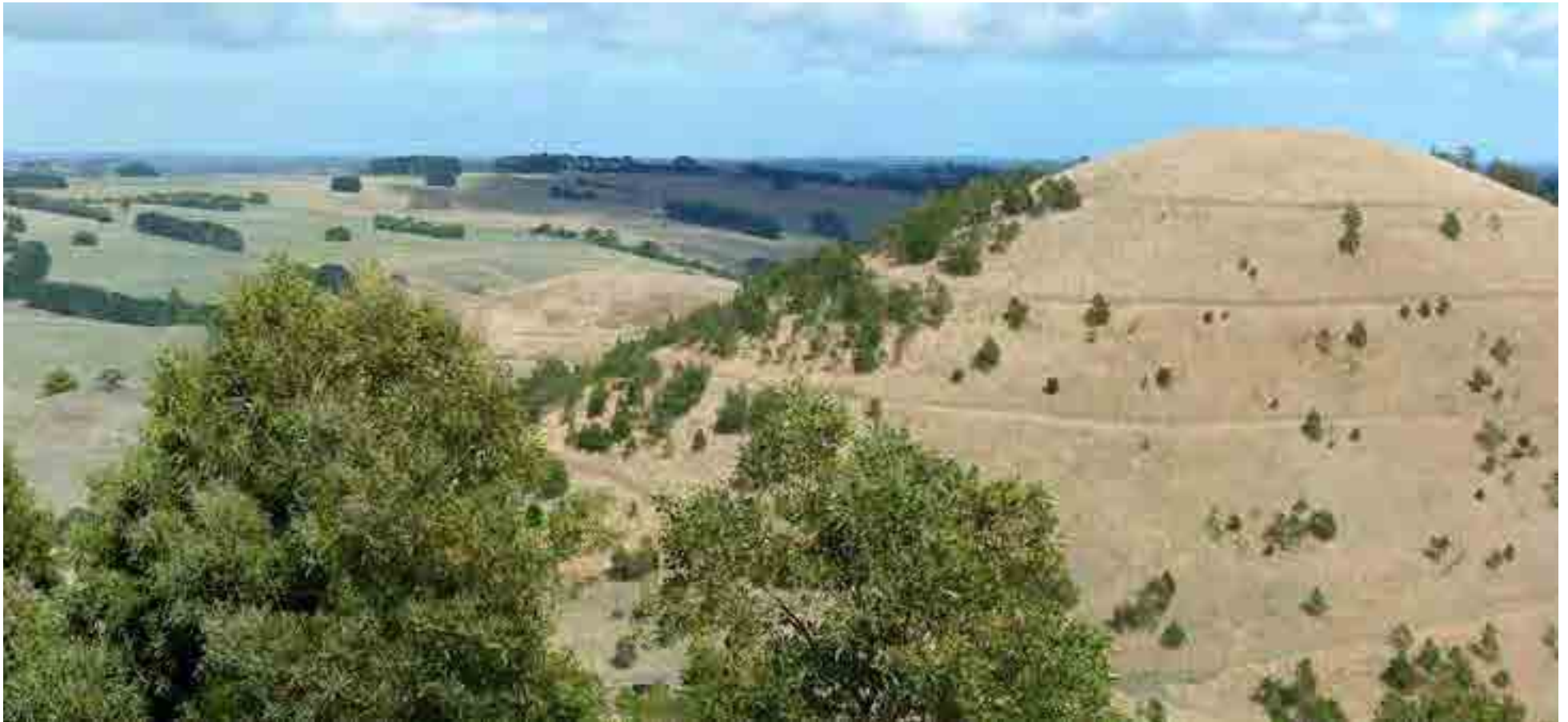
Mount Sugarloaf, part of the Mount Leura complex