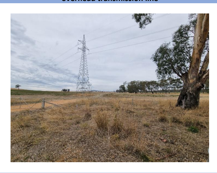
Looking southwest along Vineyard Road