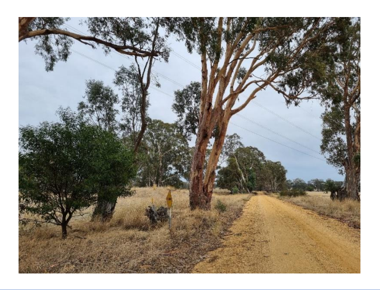
Looking southeast along Vineyard Road