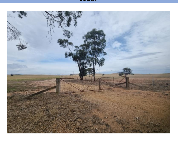
Joel South Road looking at Bulgana WTGs