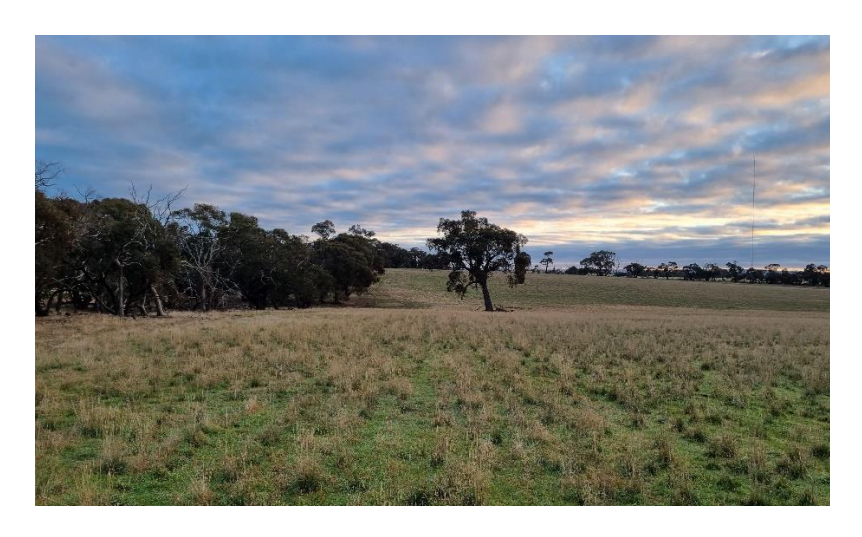
Looking west towards Concongella Hill from turbine 14