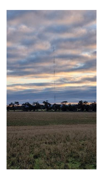
Looking west along Vances Crossing Road