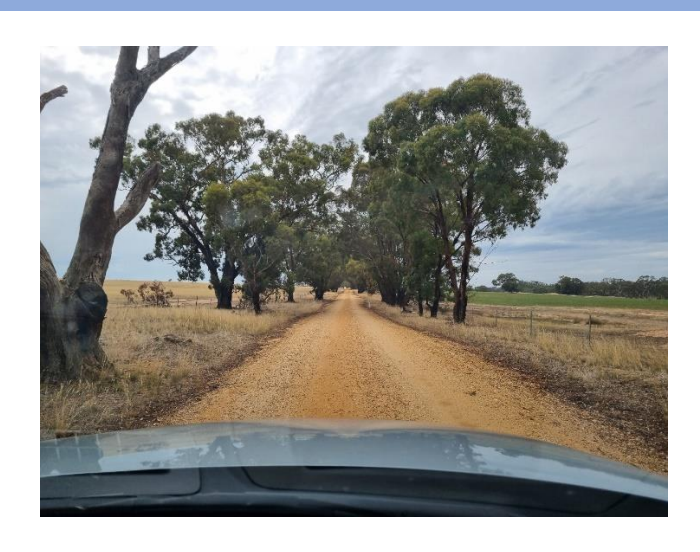
Looking west towards Concongella Hill