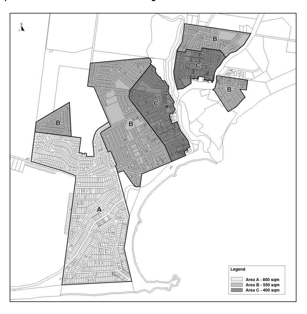
Map 2 to Schedule 19 to Clause 43.02 – Anglesea Subdivision Precincts