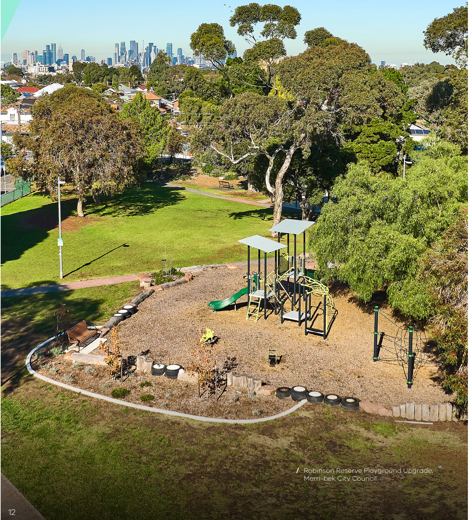
/ Robinson Reserve Playground Upgrade, Merri-bek City Council.