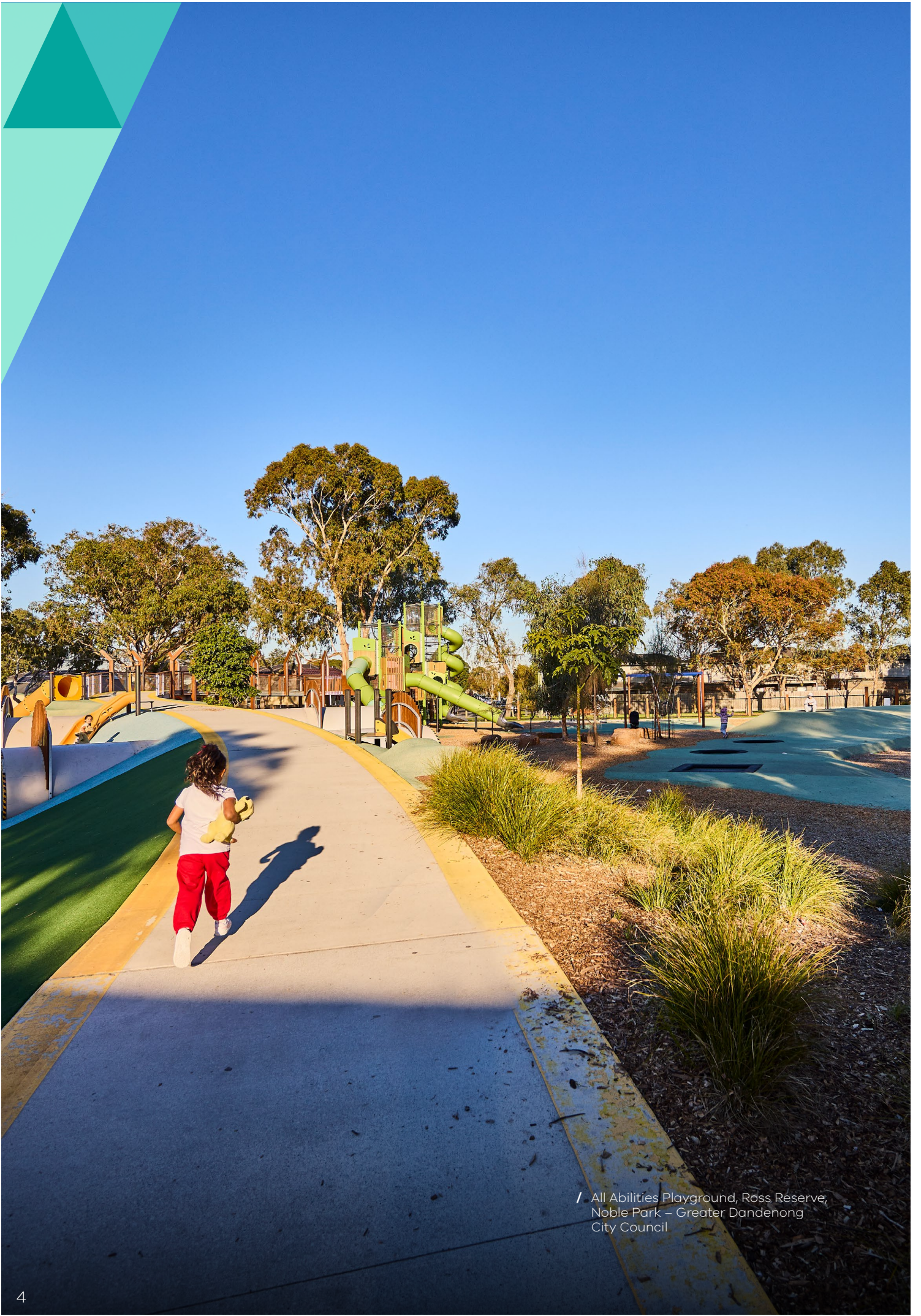
/ All Abilities Playground, Ross Reserve, Noble Park – Greater Dandenong City Council