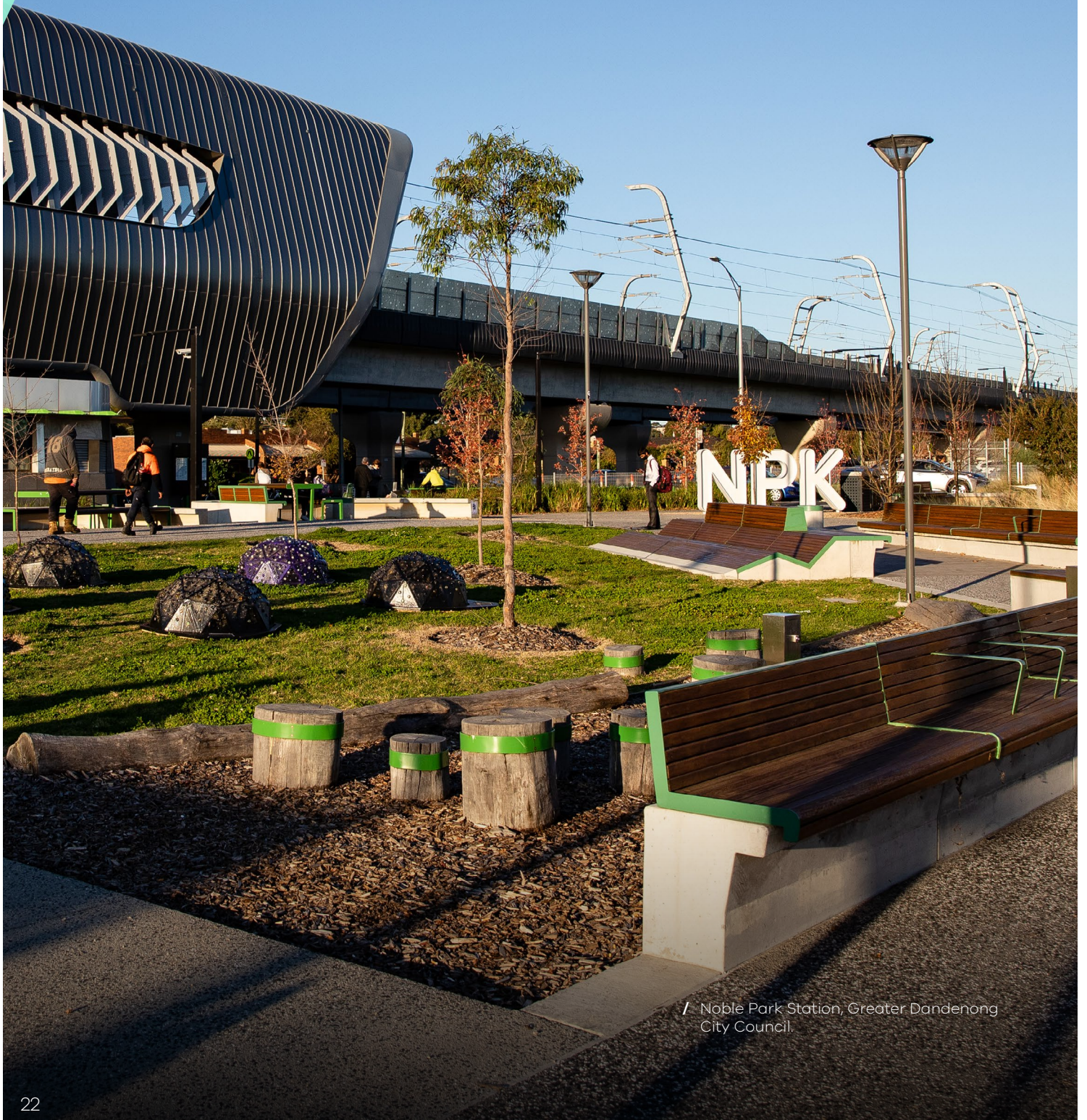
/ Noble Park Station, Greater Dandenong City Council.