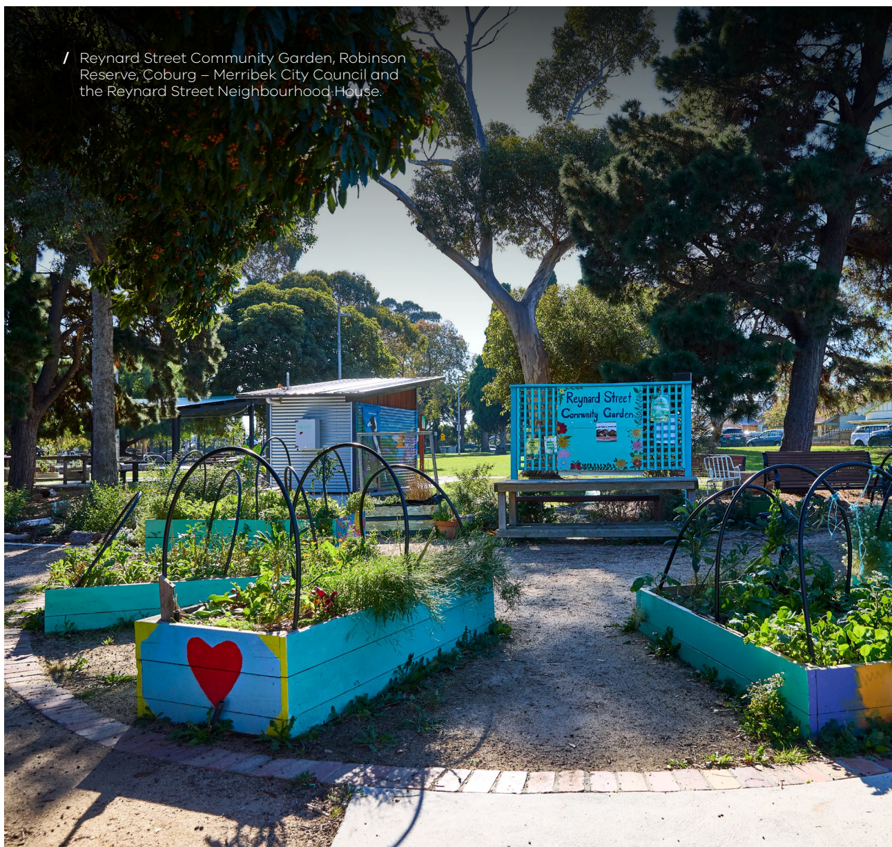
/ Reynard Street Community Garden, Robinson Reserve, Coburg – Merribek City Council and the Reynard Street Neighbourhood House.