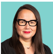
◀ The Hon. Harriet Shing MP Minister for the Suburban Rail Loop Minister for Housing and Building Minister for Development Victoria and Precincts

Together we can deliver thriving places for Victoria's growing population to live, work and connect with one another and build stronger and better communities for us all.