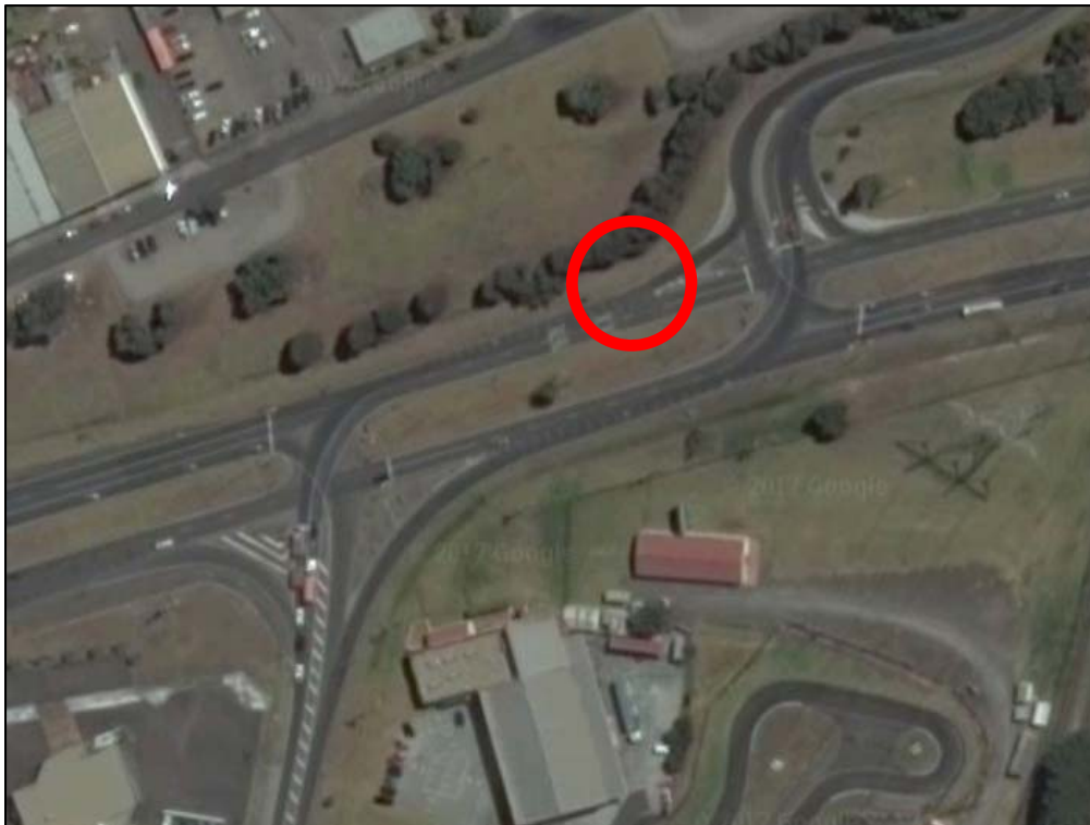
Figure 4.1 : Speed restriction sign on left-turn into Alexanders Road from Princes Drive, Morwell