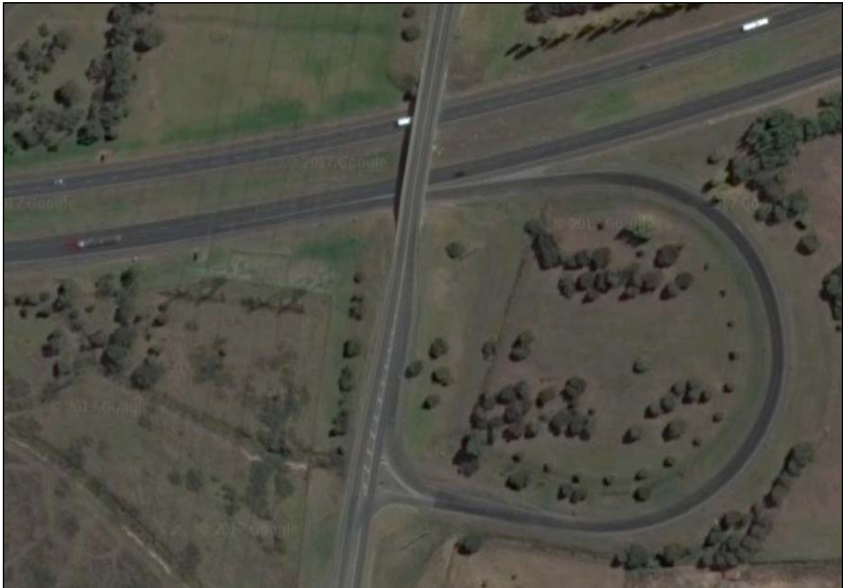
Figure 4.3 shows the approach ramp to the Princes Freeway westbound towards Melbourne from Tramway Road. The left-turn from Tramway Road and the ramp itself is steep, and further analysis may be required to check its suitability for 'over-dimensional' vehicles.