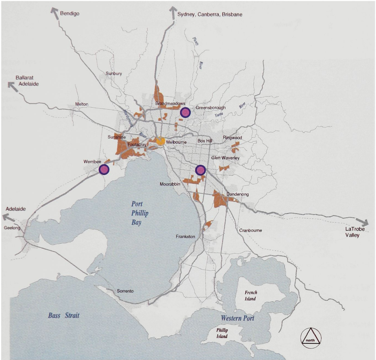
Figure 3 - METROPOLITAN MANUFACTURING AND TECHNOLOGY PRECINCTS