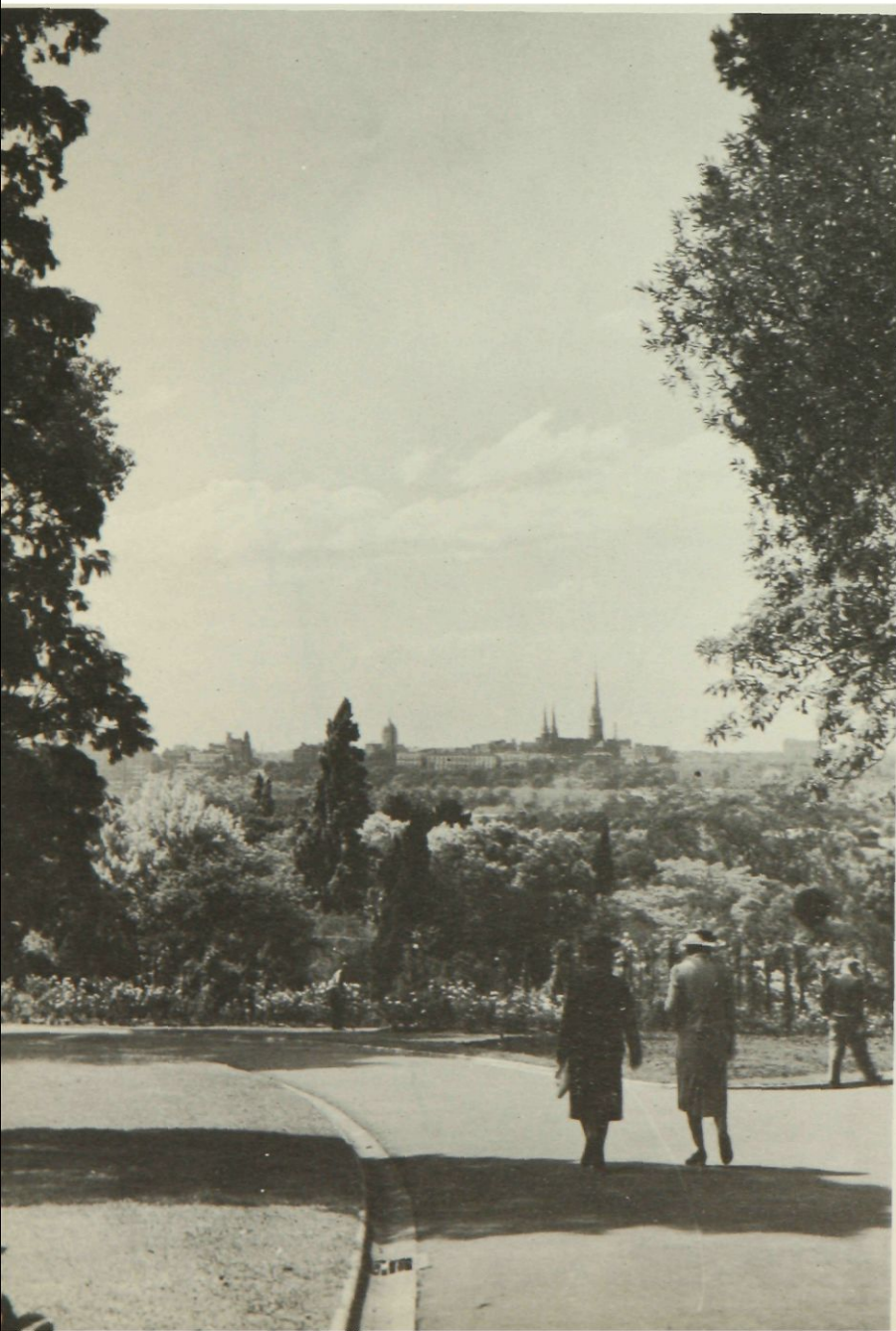
"Ornamental . . . parks . . . for rest and relaxation"