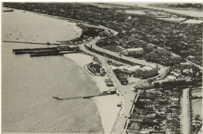
"The foreshores at St. Kilda"