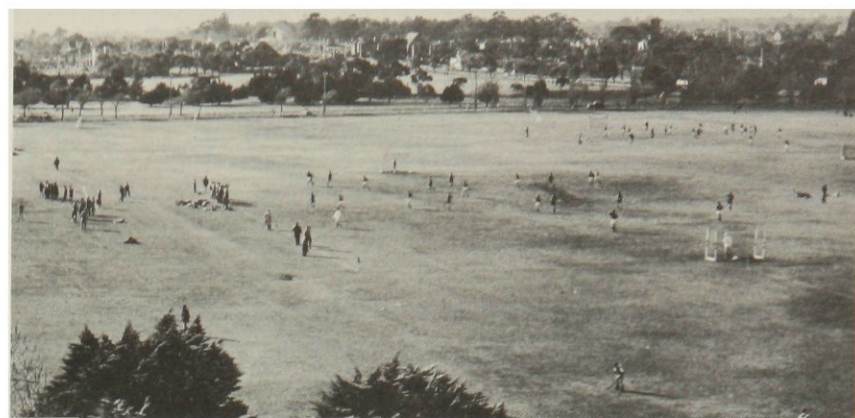
"Open space . . . for sporting purposes"