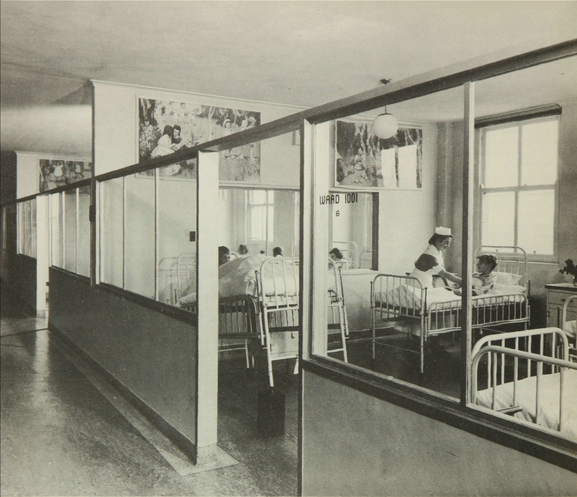
A children's ward in Prince Henry's Hospital