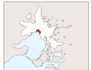
Part of Planning Scheme Map 3SCO