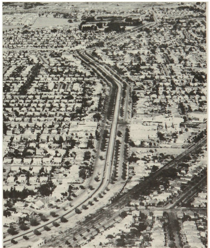
Former stock routes are today one of our major assets