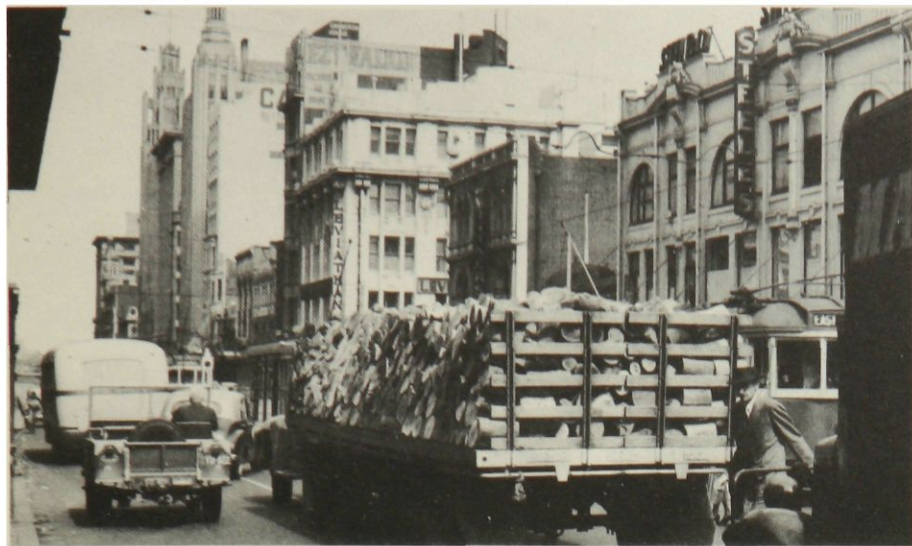
Through traffic in the central area