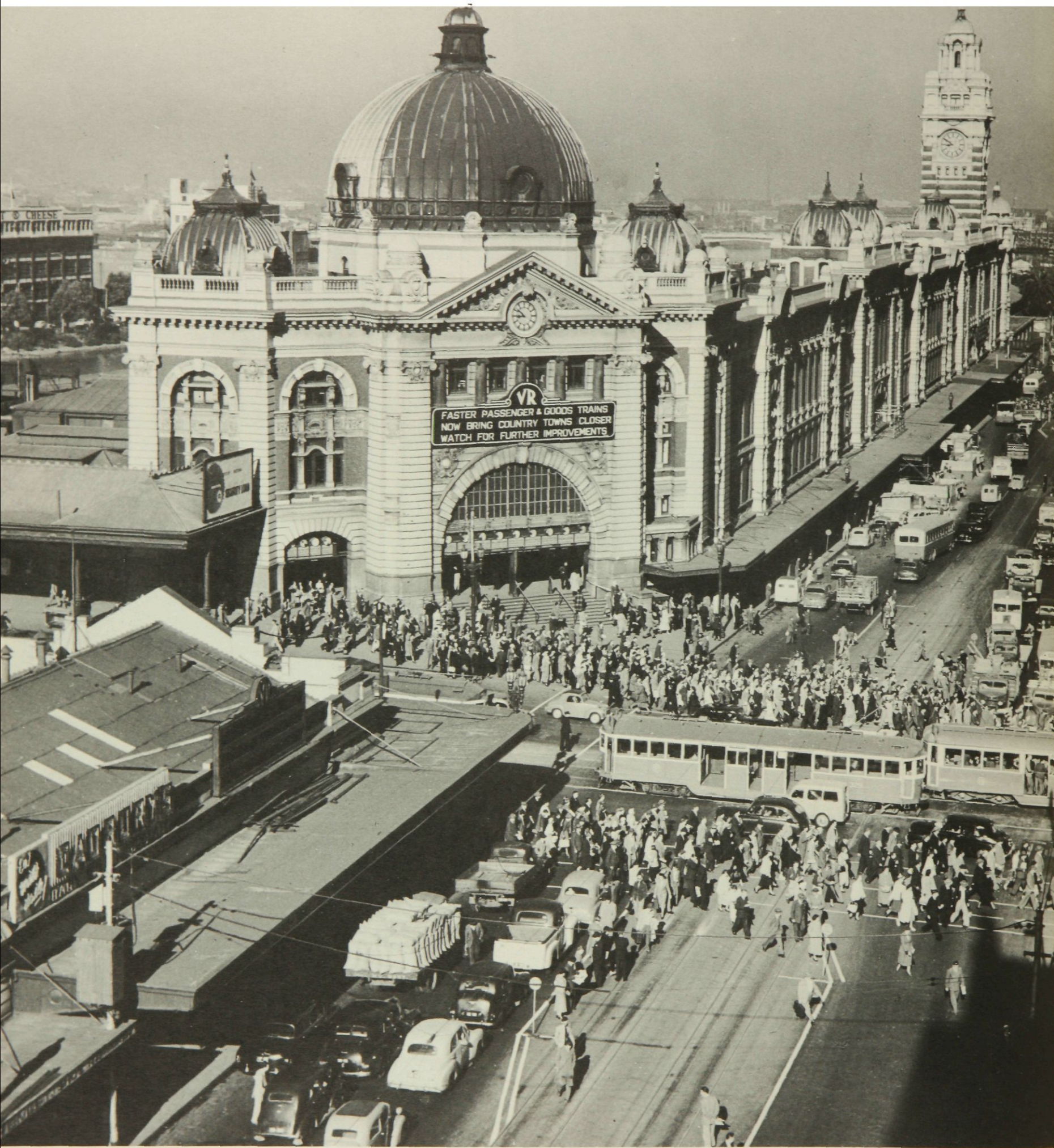
Flinders Street Station, one of the busiest in the world