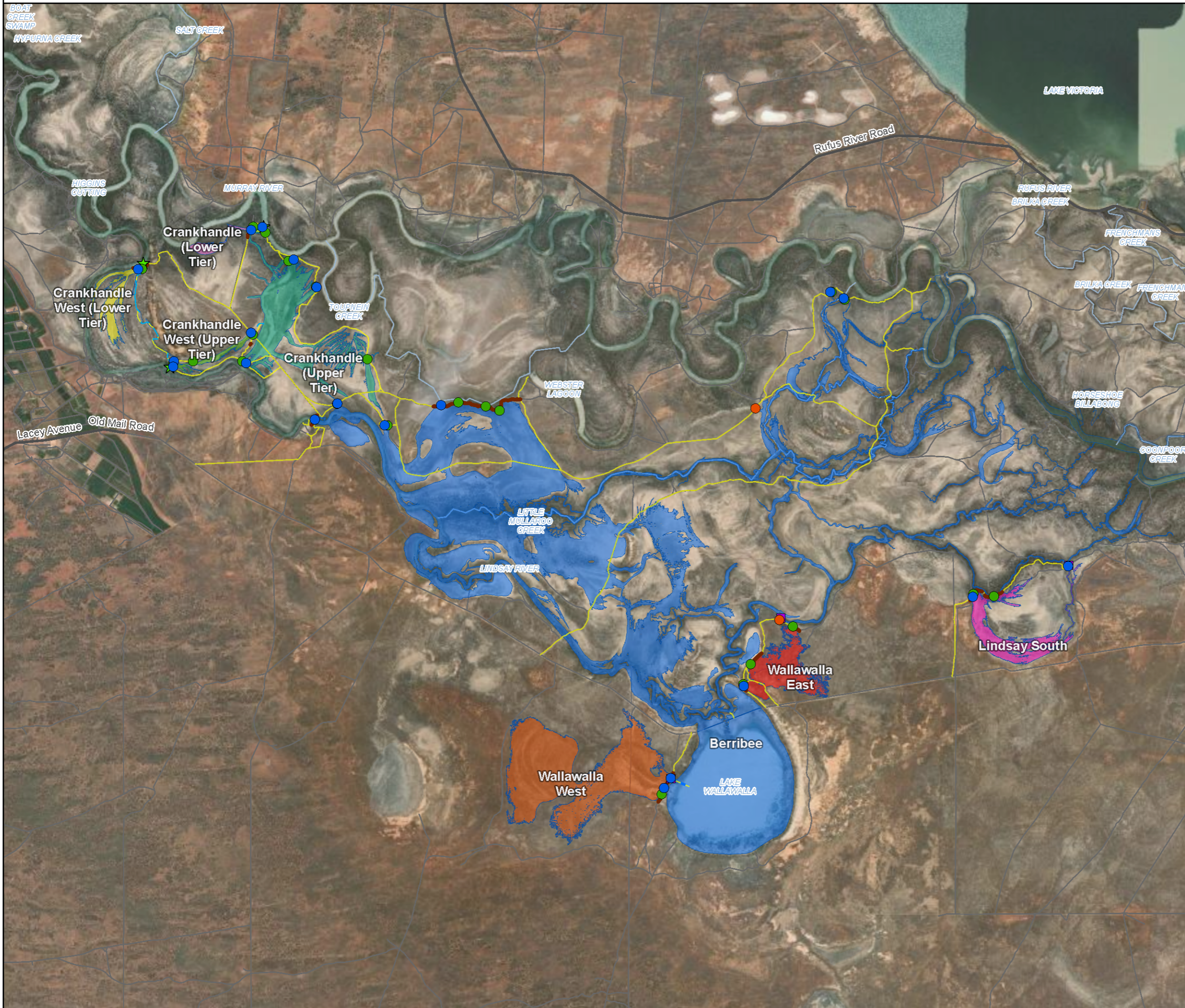
Figure 1: Lindsay Island - Summary of Works - Issued for Review Design