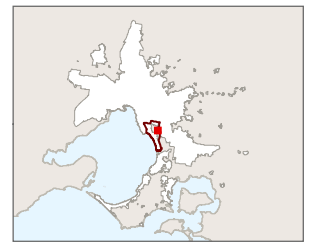
Part of Planning Scheme Map 6BAO

Disclaimer This publication may be of assistance to you but the State of Victoria and its employees do not guarantee that the publication is without flaw of any kind or is wholly appropriate for your particular purposes and therefore disclaims all liability for any error, loss or other consequence which may arise from you relying on any information in this publication.