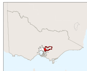
Part of Planning Scheme Map 52DPO