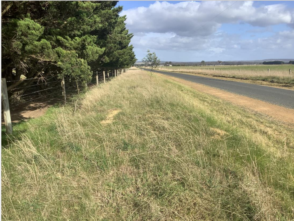
Plains Grassland on the eastern road reserve, with a notable presence of native Spear Grass.