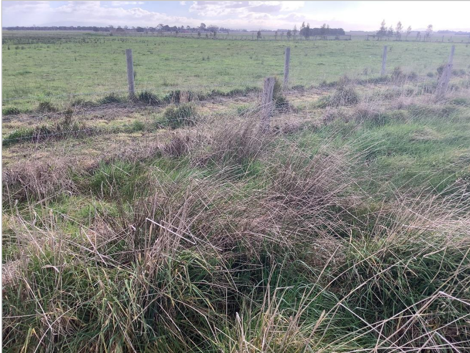
Plains Grassy Wetland on the western road reserves.