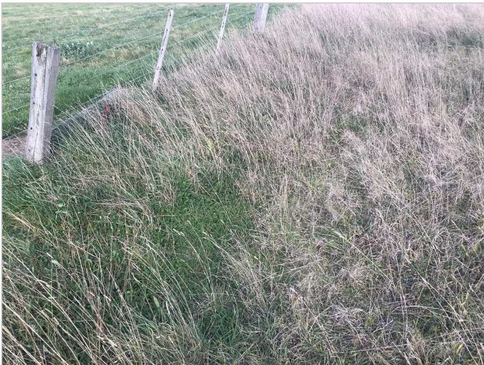
Typical native groundcover, including Spear Grass and Sheep's Burr.