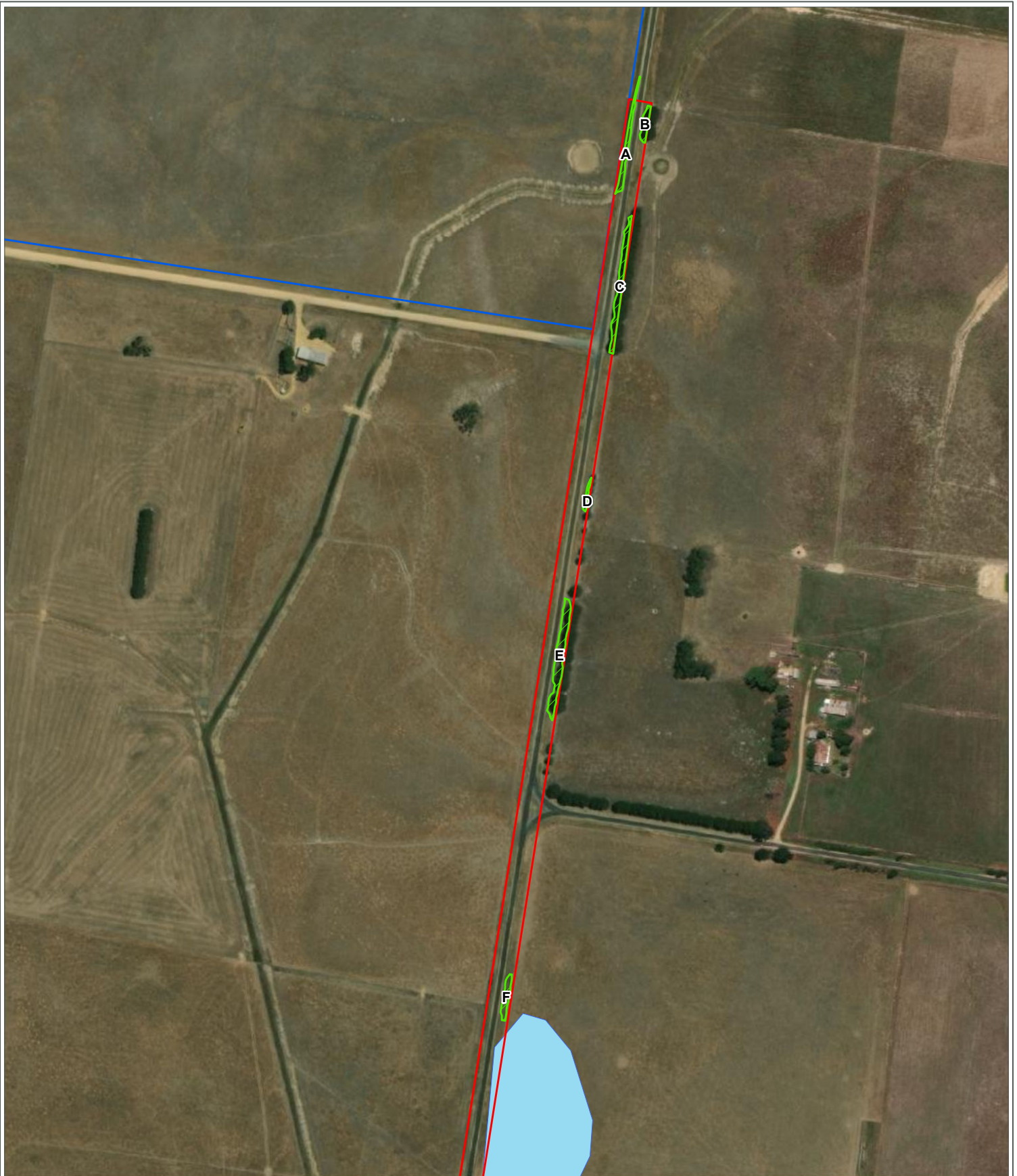
Figure 1: Study area and native vegetation

Project: Hopkins Road, Fulham Client: Solis Renewable Energy Pty Ltd Date: 3/08/2021