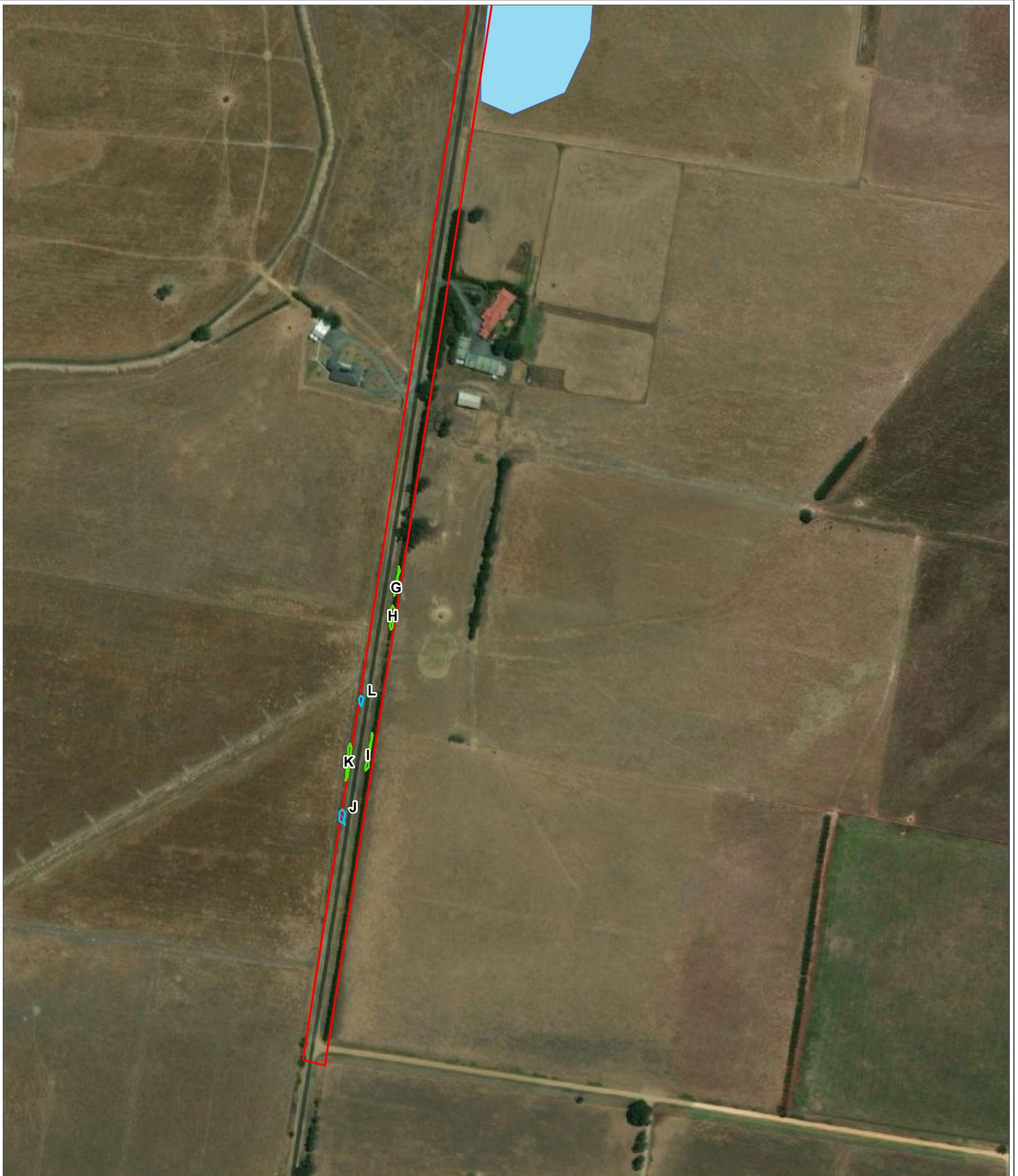
Figure 2: Study area and native vegetation

Project: Hopkins Road, Fulham Client: Solis Renewable Energy Pty Ltd Date: 3/08/2021