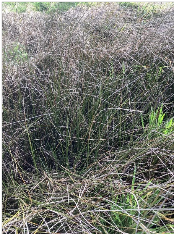
Dense clumping of natives rushes amongst introduced pasture grasses.