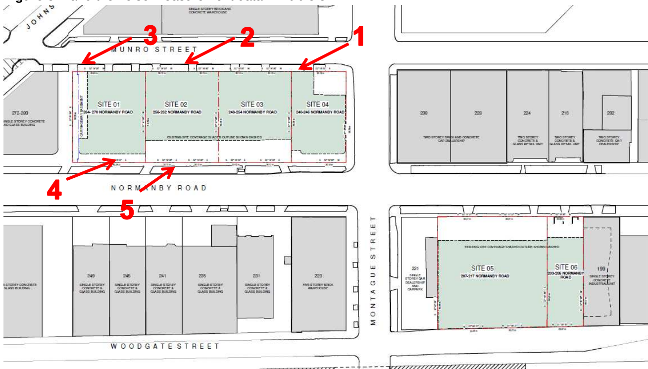
Figure 5-1: Noise measurement positions

The daytime survey was to quantify the noise climate in the vicinity of the proposed development. The results are used to inform the design of the building envelope to achieve the indoor ambient noise levels. Daytime noise measurements were taken between 4.30pm and 6:30pm to measure the worst case traffic noise, the traffic was free flowing. The noise environment around the proposed development was dominated by road traffic noise from both Normanby Road and Montague Street. The measurement positions are indicated in Figure 5-1 and the noise measurement data in Table 5-1 .