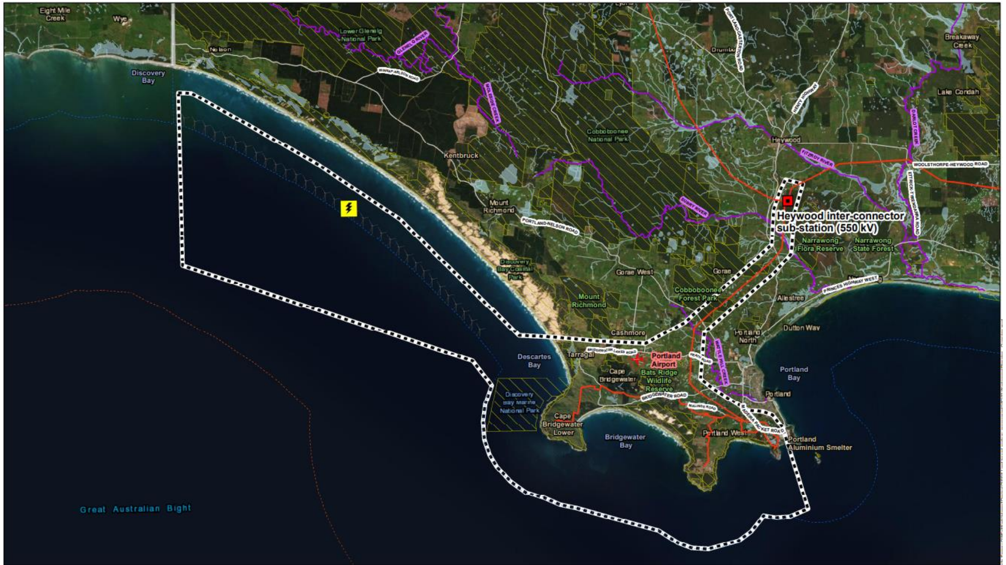
Figure 1: Location of the project.