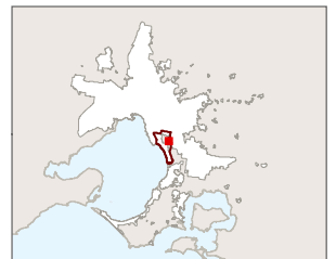
Part of Planning Scheme Map 6DPO