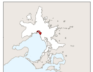
Part of Planning Scheme Map 6SCO