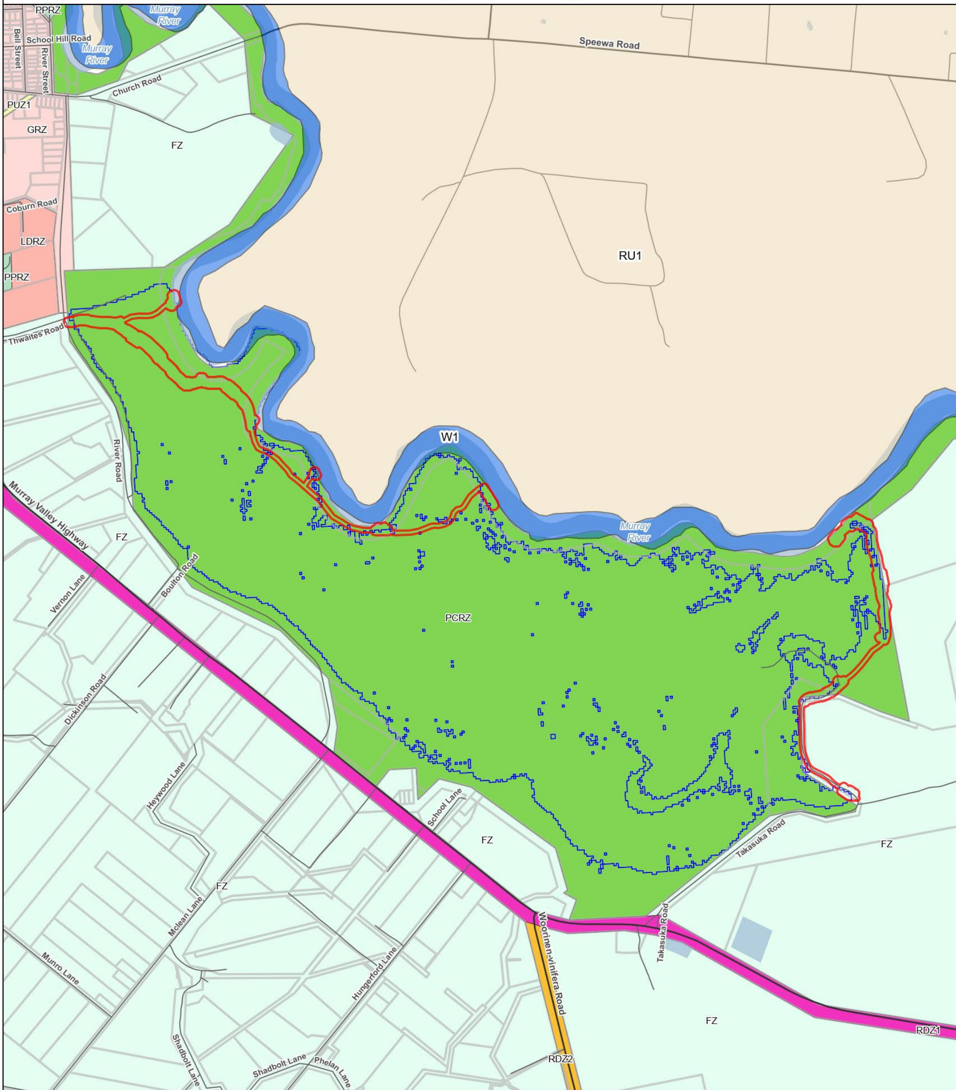
Figure 4.1 Vinifera Floodplain Restoration Project - Planning Zones VMFRP