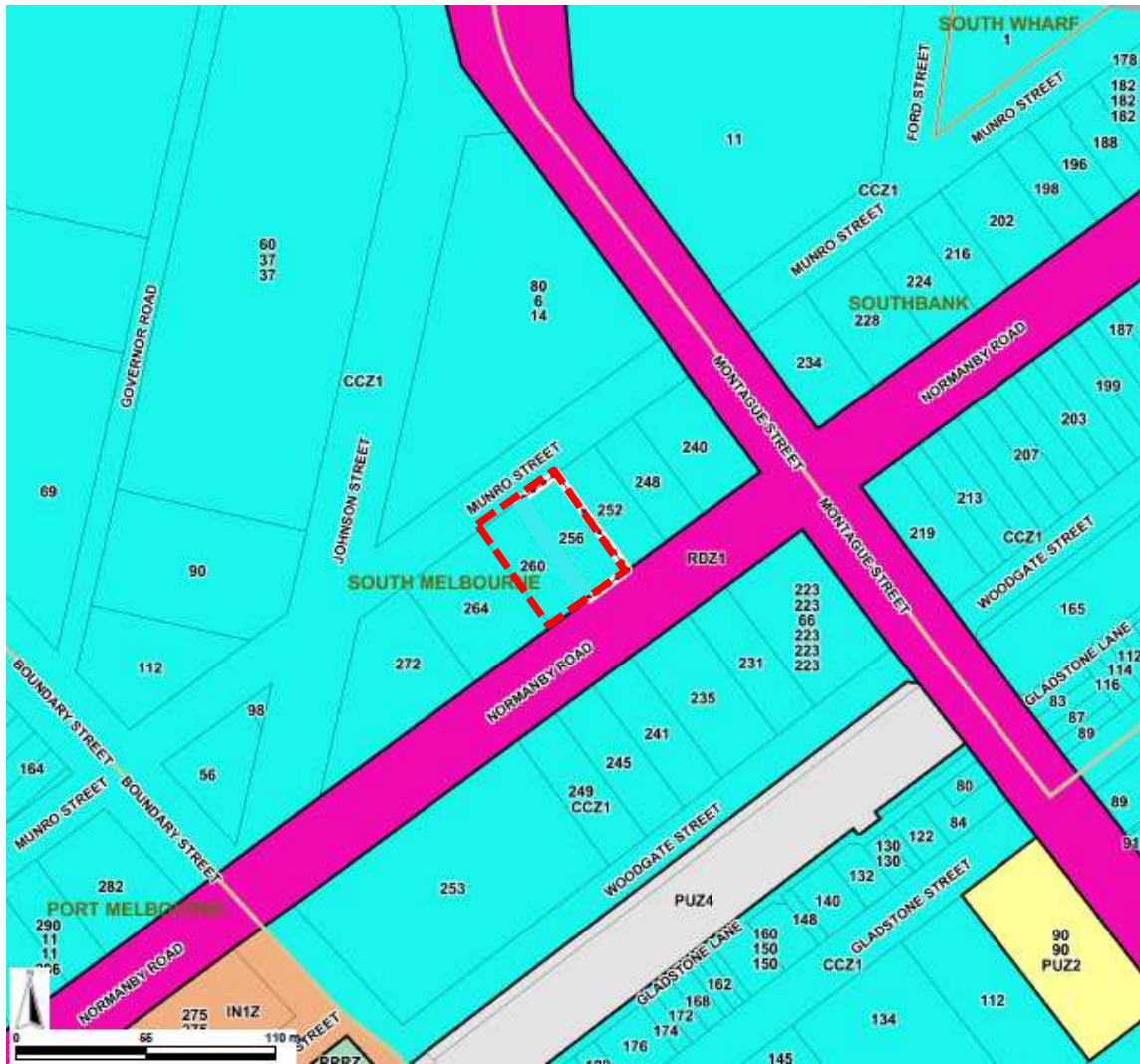
Figure 4-2: Zoning Map