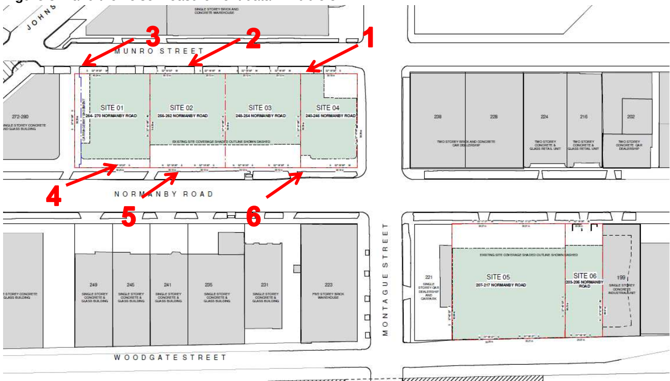
Figure 5-1: Noise measurement positions

The daytime survey was to quantify the noise climate in the vicinity of the proposed development. The results are used to inform the design of the building envelope to achieve the indoor ambient noise levels. Daytime noise measurements were taken between 4.30pm and 6:30pm to measure the worst case traffic noise, the traffic was free flowing. The noise environment around the proposed development was dominated by road traffic noise from both Normanby Road and Montague Street. The measurement positions are indicated in Figure 5-1 and the noise measurement data in Table 5-1 .