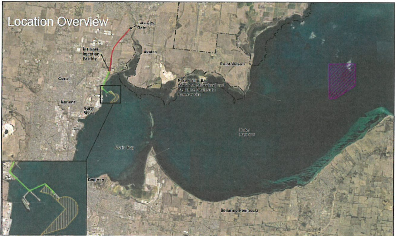
Figure 1: Project location (source: Viva Energy Pty Ltd).

These scoping requirements provide further detail on the matters to be investigated in the EES as required by the Ministerial guidelines for assessment of environmental effects under the Environment Effects Act 1978 (Ministerial Guidelines).