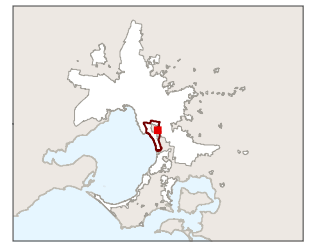
Part of Planning Scheme Map 6VPO

Disclaimer This publication may be of assistance to you but the State of Victoria and its employees do not guarantee that the publication is without flaw of any kind or is wholly appropriate for your particular purposes and therefore disclaims all liability for any error, loss or other consequence which may arise from you relying on any information in this publication.