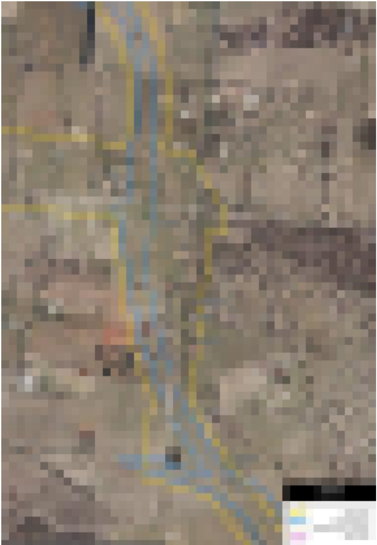
Map 8: MAL alignment, central section, with activity area and registered VAHR sites