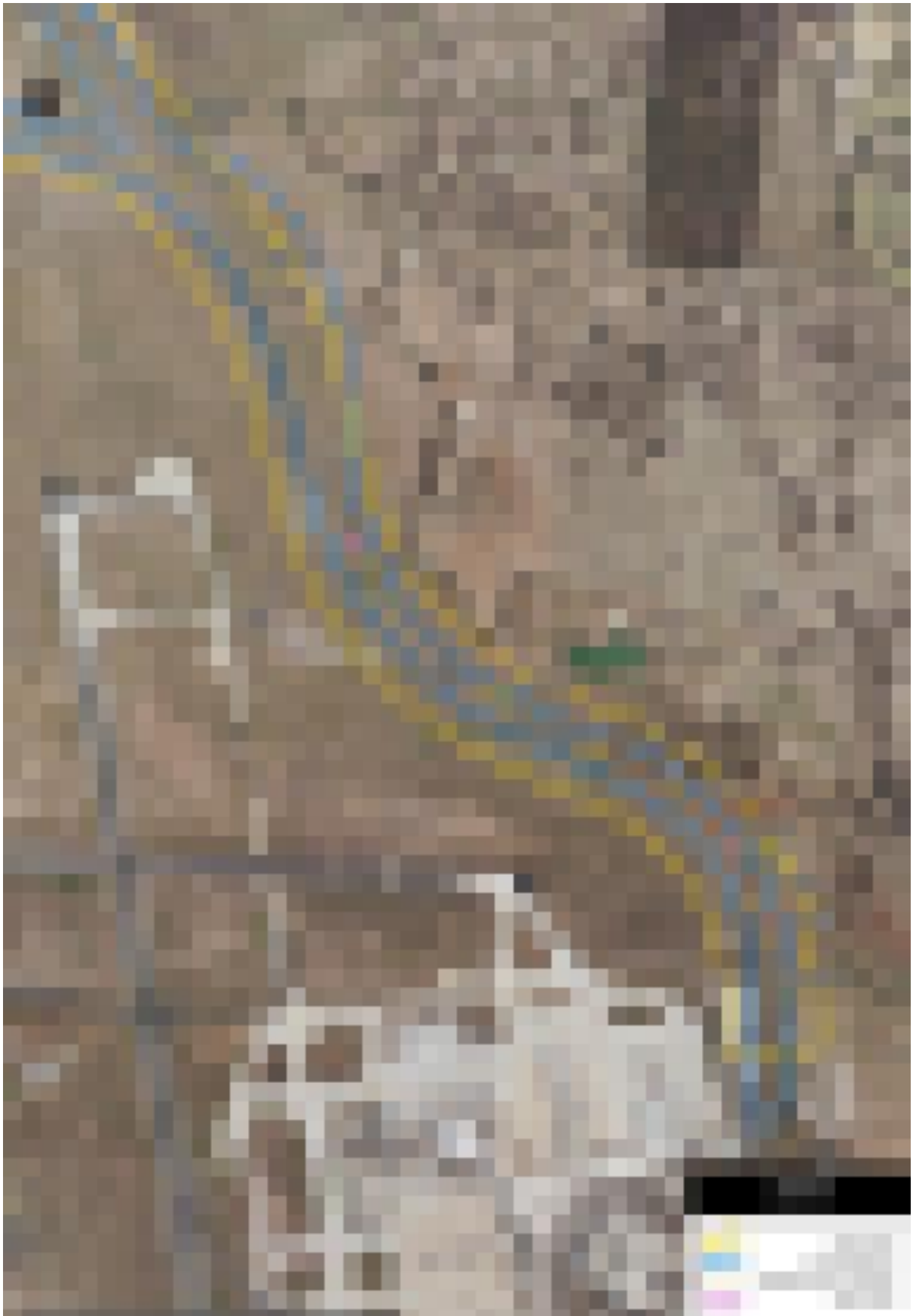
Map 7: MAL alignment, south section, with activity area and registered VAHR sites