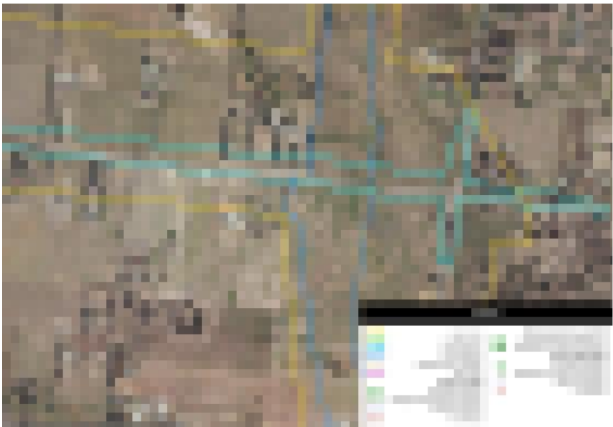
Map 3: BB5 alignment, east section, with activity area, registered VAHR sites and subsurface testing