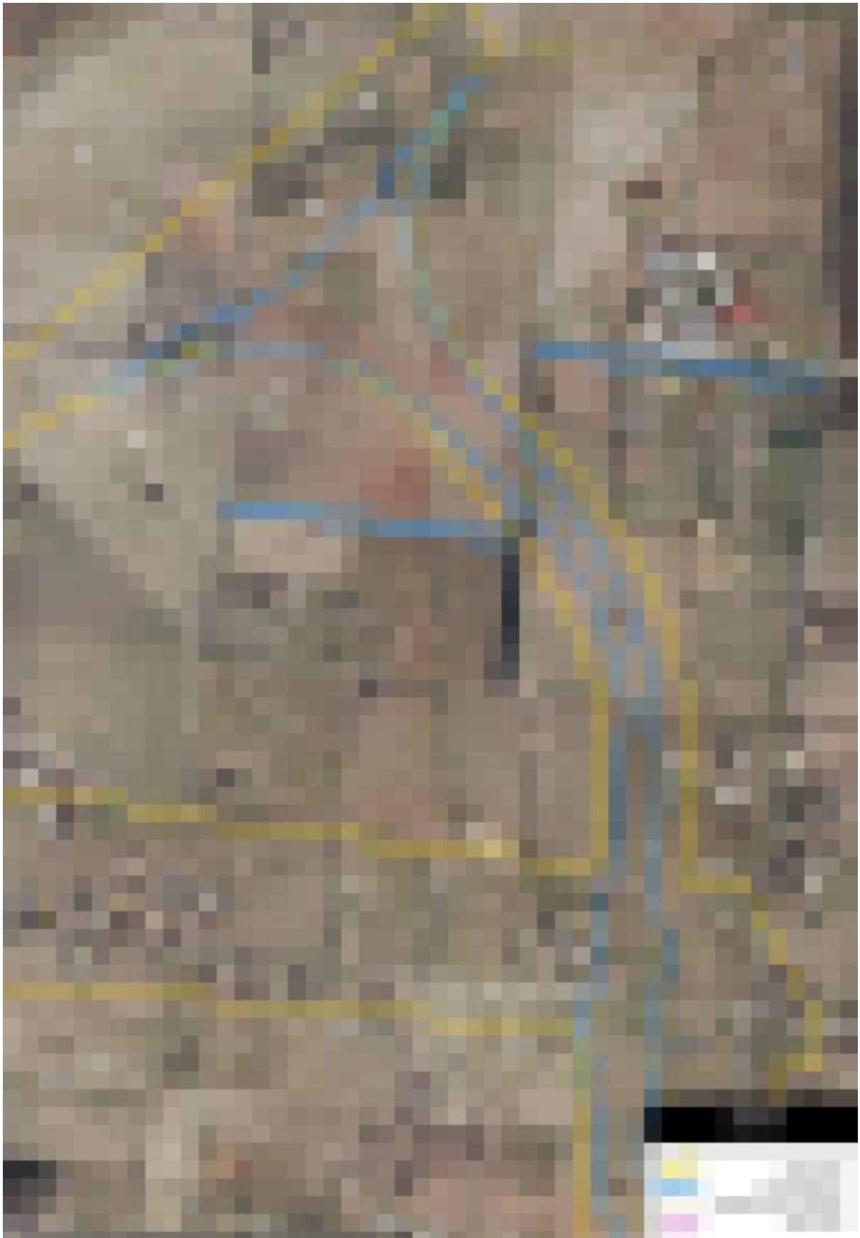
Map 9: MAL alignment, north section, with activity area and registered VAHR sites