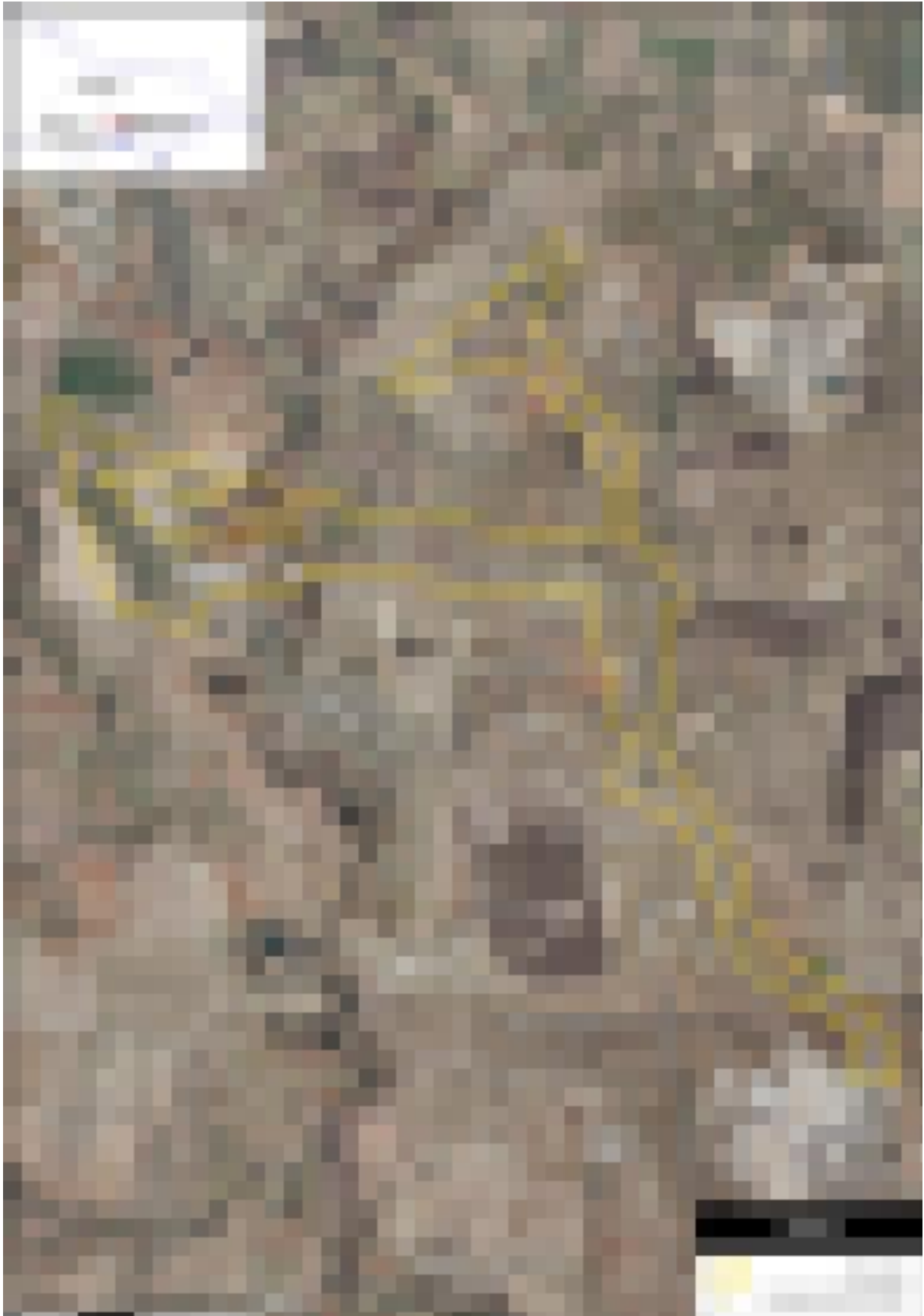
Map 1: Activity area for CHMP 11935 showing two previously recorded VAHR places