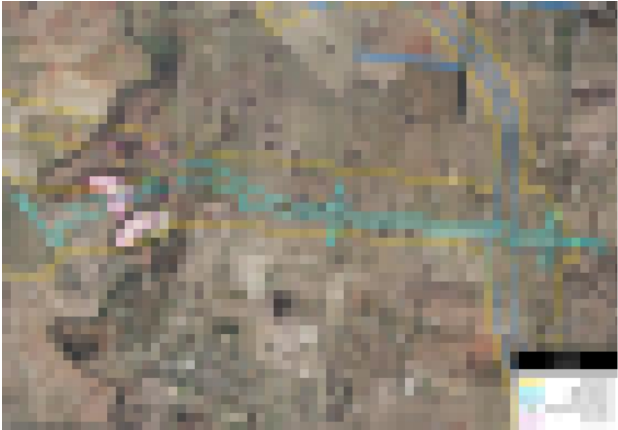
Map 2: BB5 alignment with activity area and registered VAHR sites