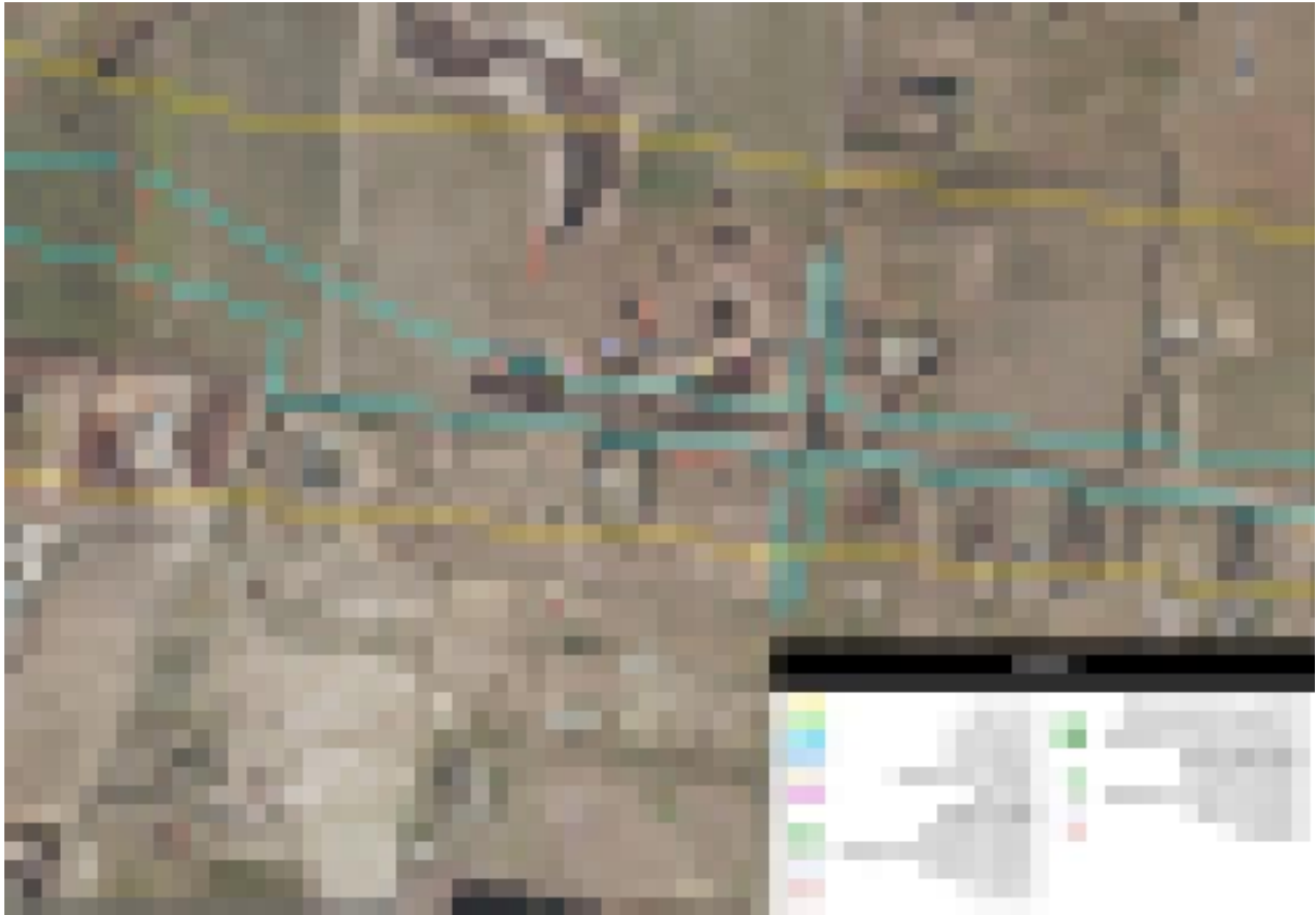
Map 4: BB5 alignment, central section, with activity area, registered VAHR sites and subsurface testing