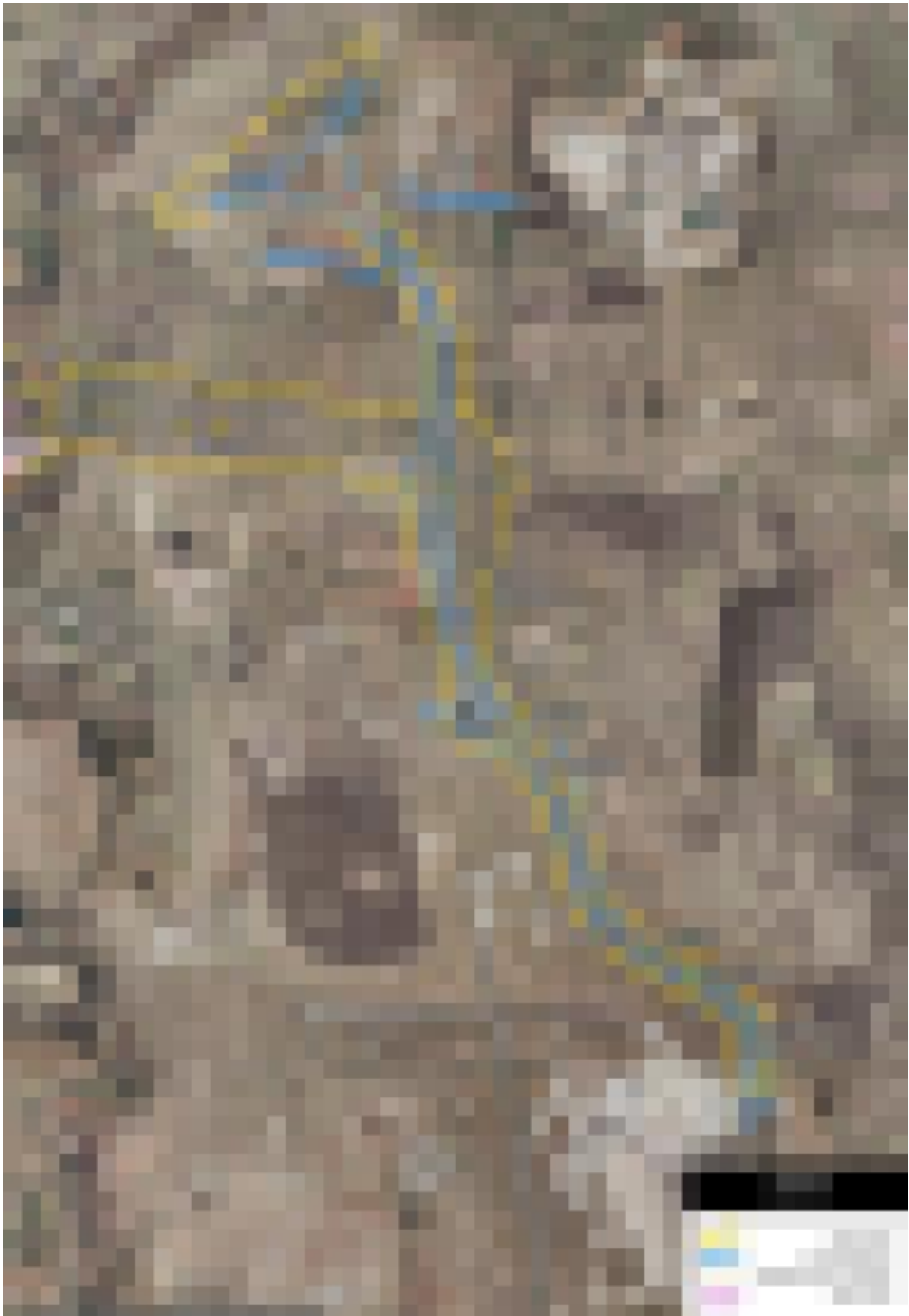
Map 6: MAL alignment with activity area and registered VAHR sites