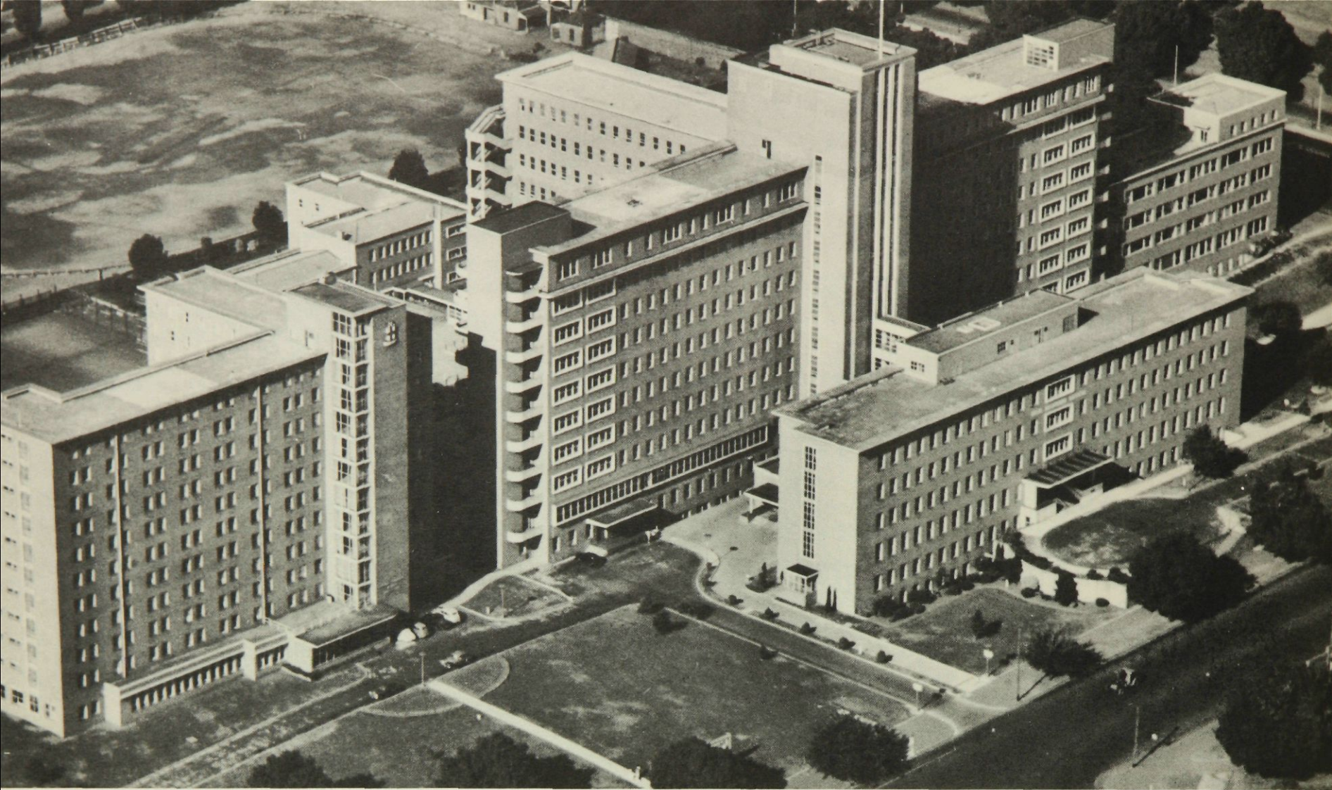
Royal Melbourne Hospital