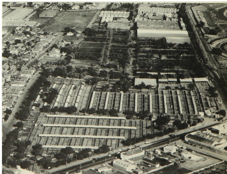
Newmarket Stock Saleyards and Council Abattoirs