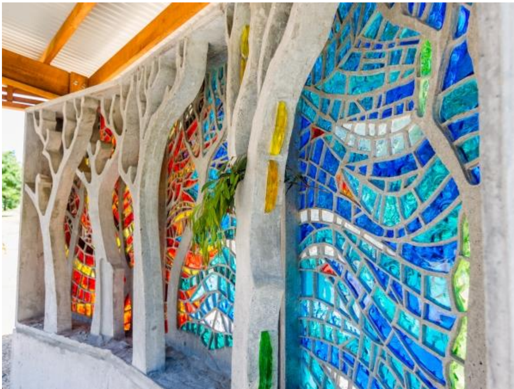
Yarra Glen Bushfire Memorial