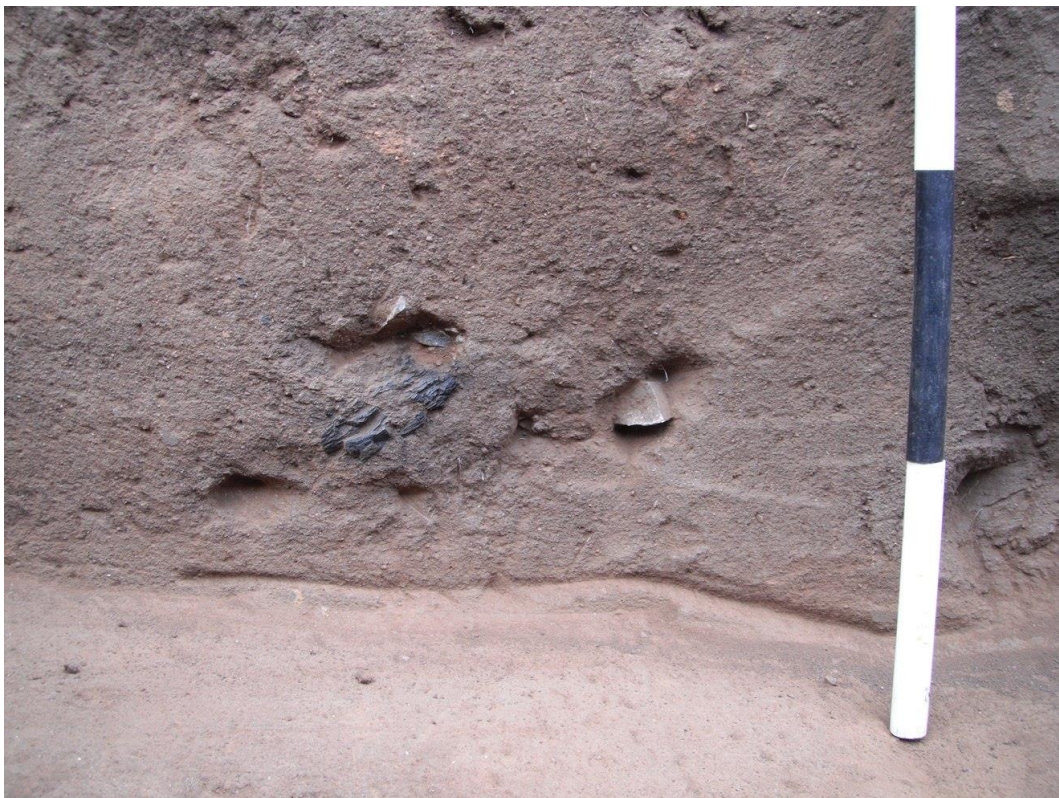
Figure 7: Charcoal sample (MEP-2) collected from east wall of trench at 1.4m