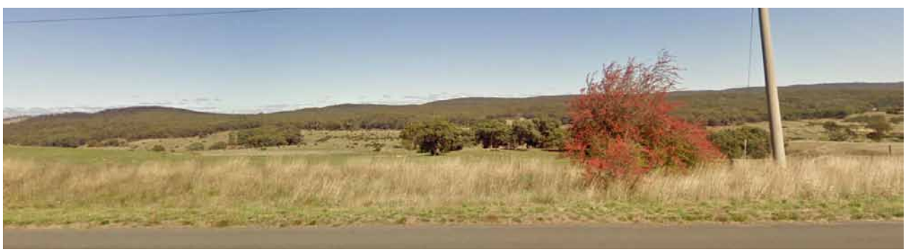
The Castlemaine National Park contrasts against the surrounding cleared paddocks