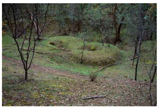
Mining relics within the Park

A detailed significance assessment is provided over the following pages.