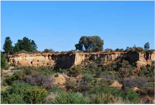
Forrest Creek diggings, part of the Castlemaine Diggings National Heritage Park