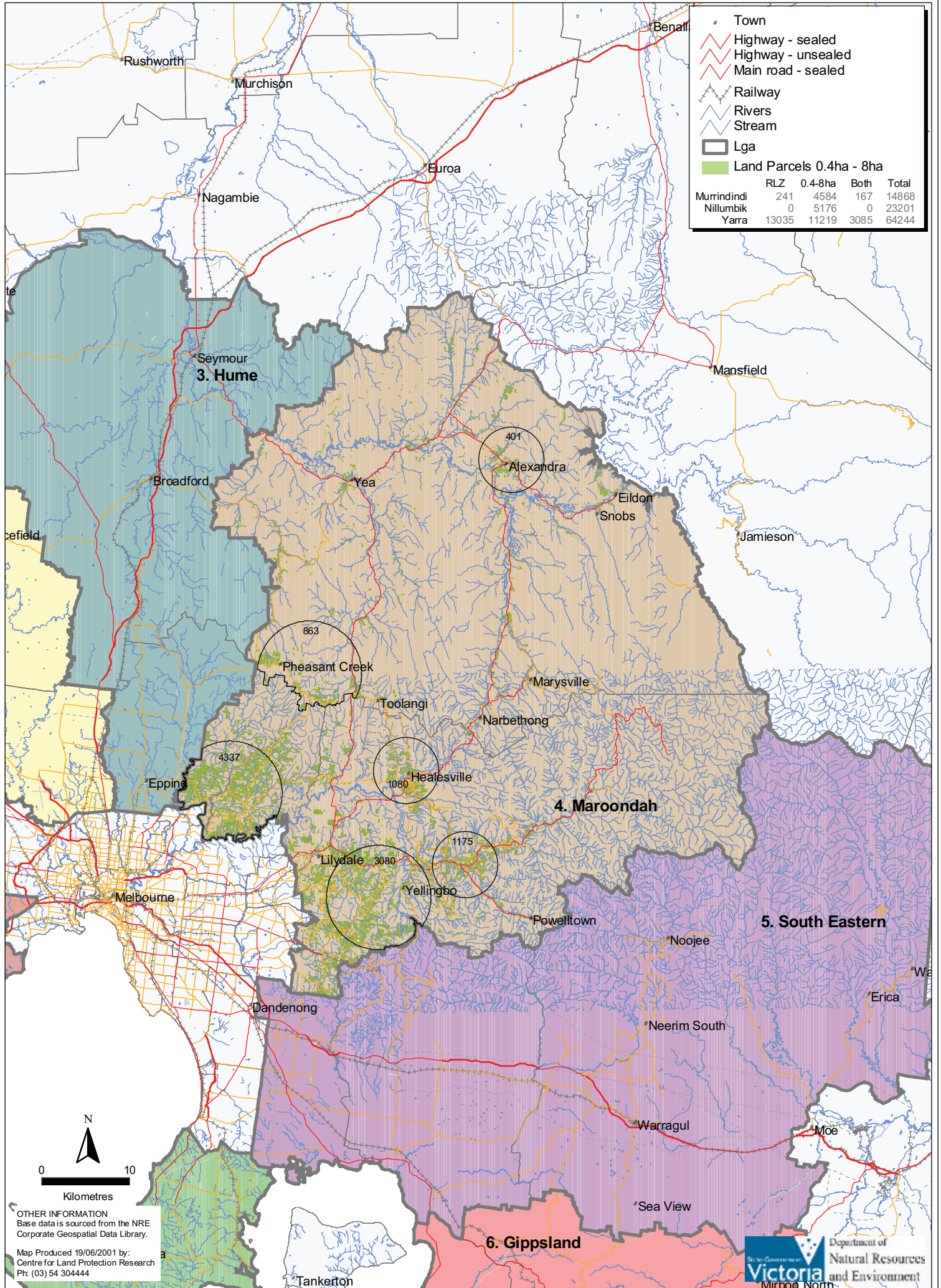
Map 2.2 Maroondah Corridor Land Parcels 0.4-8ha