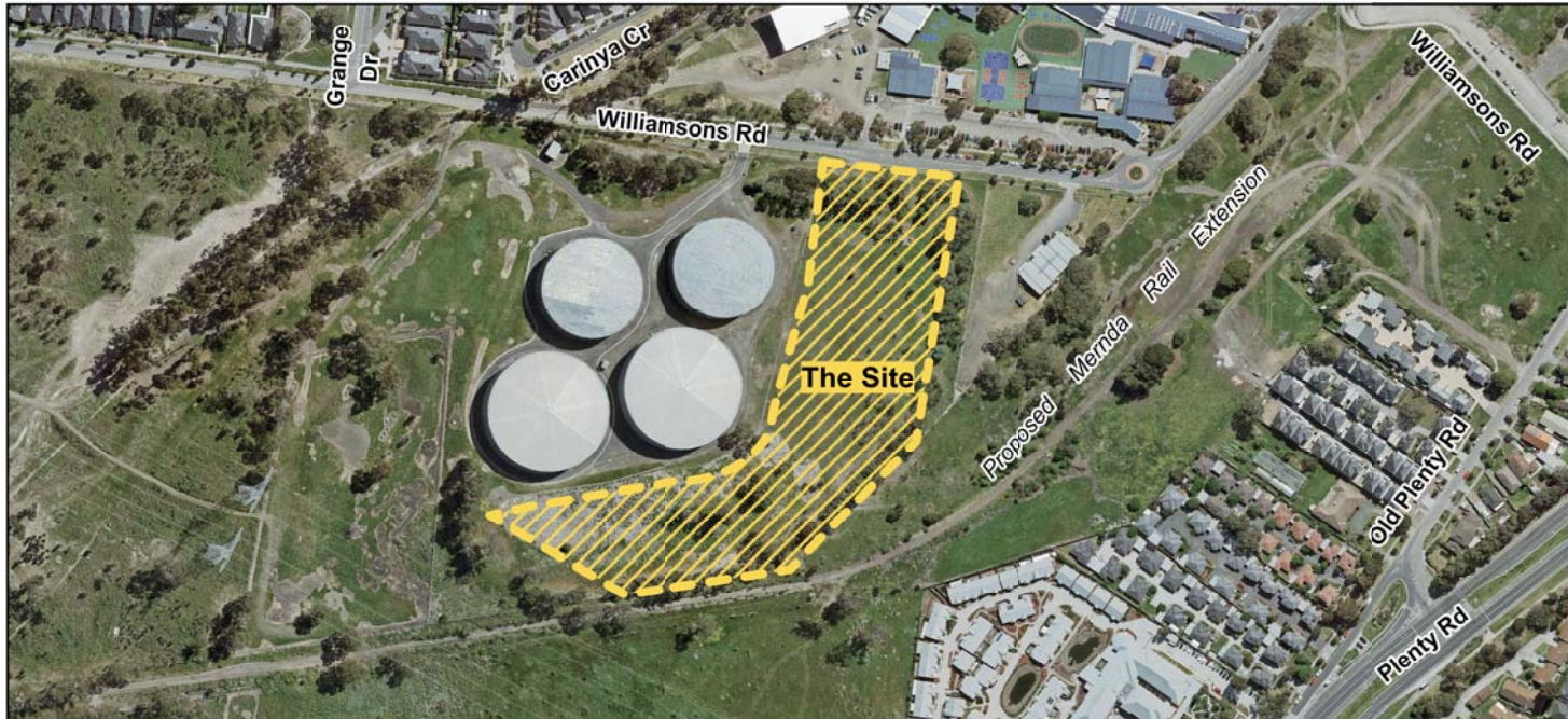
Current Planning Zone