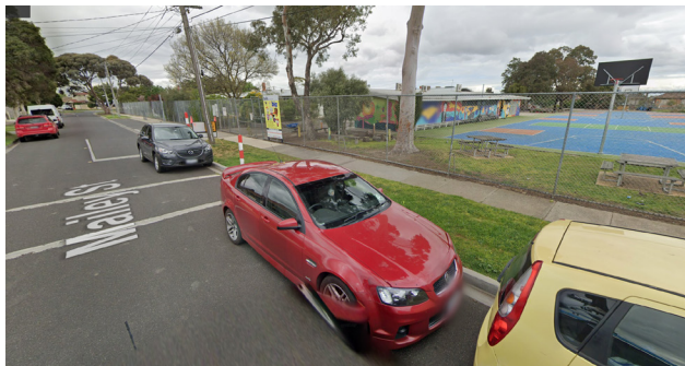
Mailey St - Sunshine Heights Primary School

Safe school zones on the street facing the school entrance should also be considered.