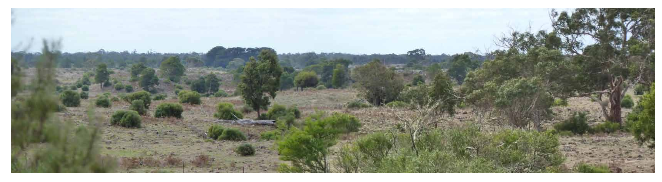
Low, scrubby vegetation among the stony rises

A detailed significance assessment is provided over the following pages.