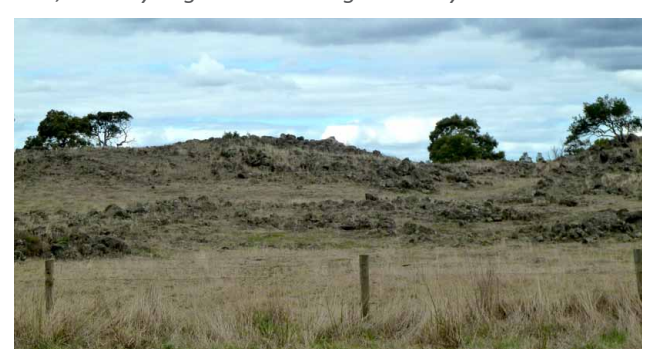
Dense concentrations of stony rises