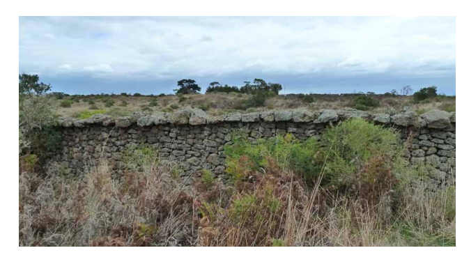
The Rabbit Wall