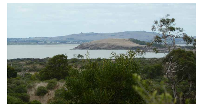
Glimpses across to Lake Corangamite