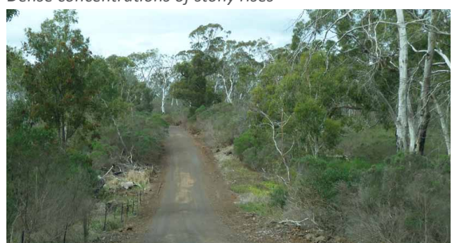
Thick, remnant vegetation