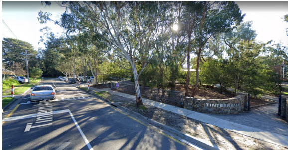
Tintern Ave - Tinternvale Primary School

Safe school zones on the street facing the school entrance should also be considered.