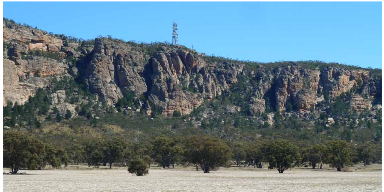
Exposed sandstone faces