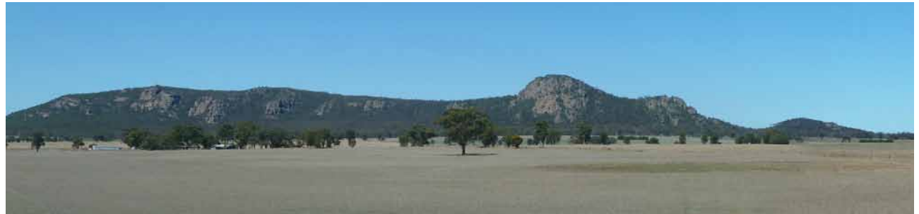
Mount Arapiles silhouette rises from the flat plain

A detailed significance assessment is provided over the following pages.