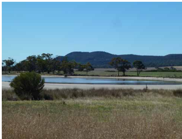
Wetlands provide the setting for other regional landscape features such as Mount Arapiles