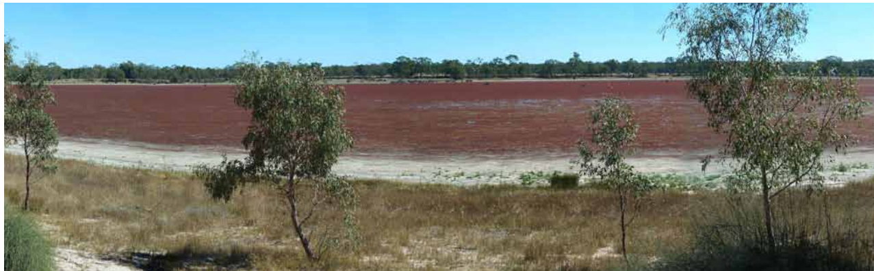
Red soils of Saint Mary Lake

A detailed significance assessment is provided over the following pages.