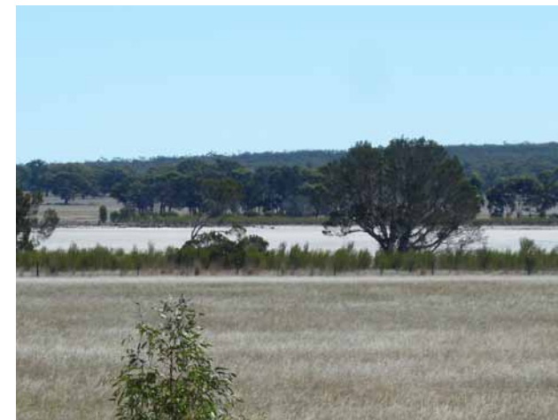
Saline pans edged with vegetation stand out from the pastoral landscape.