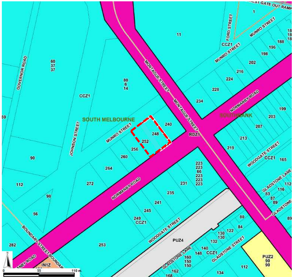
Figure 4-2: Zoning Map